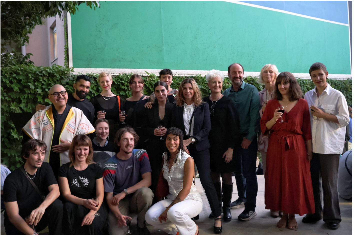
AWARD CEREMONY AT IAC DURING LA BIENNALE DE LYON. LYON.