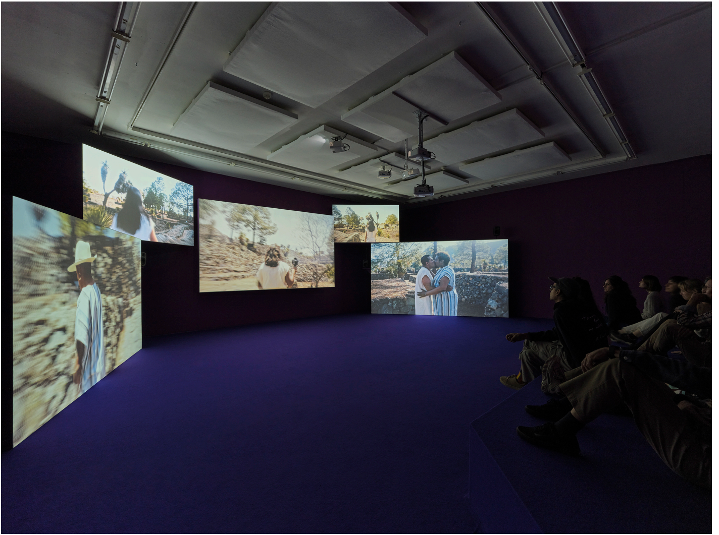
AMOXTLI (THEY BECAME WITCHES). 2024. INSTALLATION VIEW IN LA VOIX DES FLEUVES. CROSSING THE WATER. LA BIENNALE DE LYON. LYON.