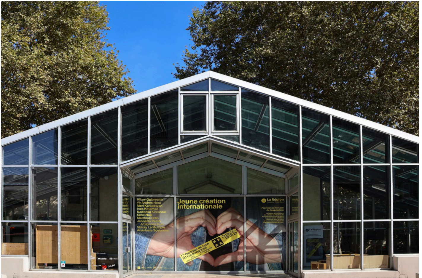
IAC FACADE DURING LA BIENNALE DE LYON. LYON.