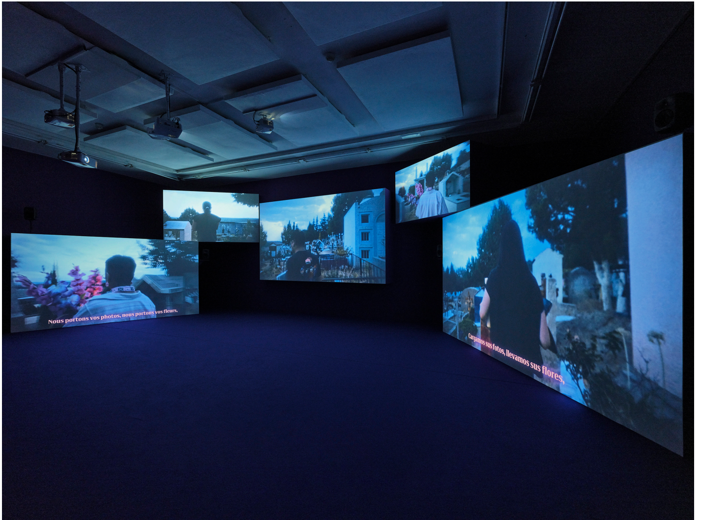
AMOXTLI (MALINTZIN PANTEON). 2024. INSTALLATION VIEW IN LA VOIX DES FLEUVES. CROSSING THE WATER. LA BIENNALE DE LYON. LYON.