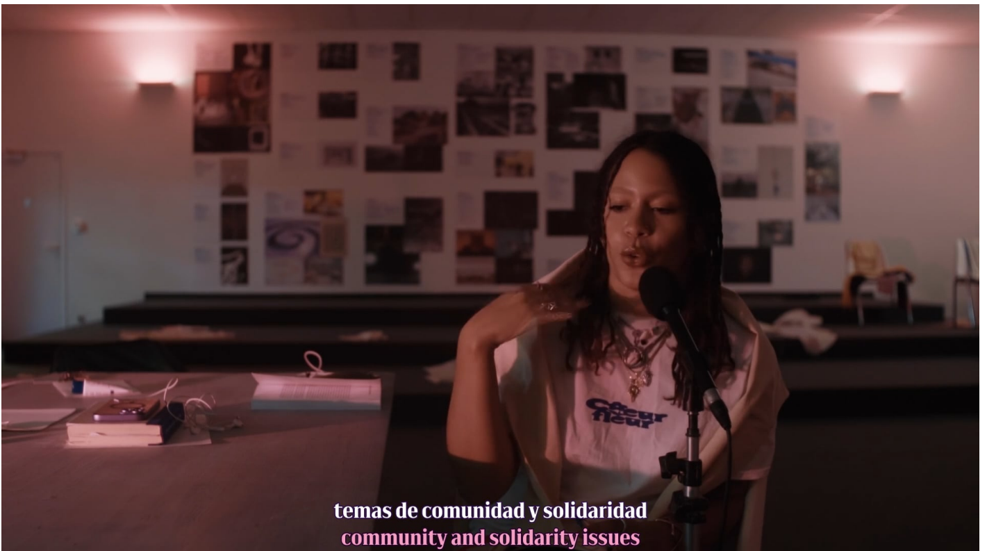
MINI-DOCUMENTARY FEATURING PARTICIPANTS IN AMOXTLI. PRODUCED BY THE COMMUNICATION DEPARTMENT OF THE INSTITUT D'ART CONTEMPORAIN, VILLEURBANNE/RHÔNE-ALPES, DURING THE 17TH LYON BIENNALE.