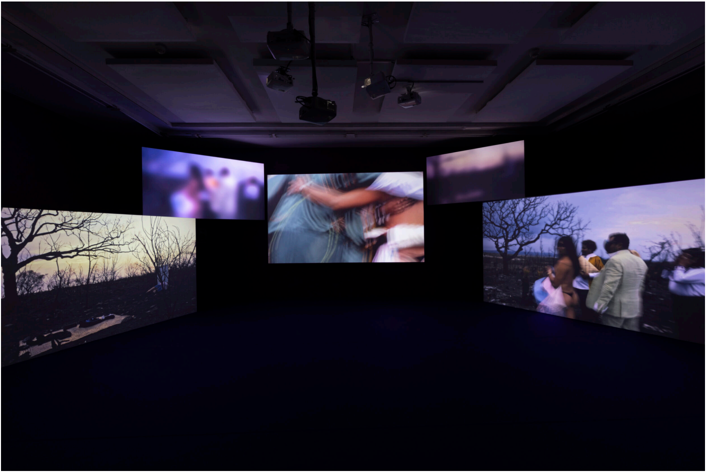
AMOXTLI (BOIS BRILÉ). 2024. INSTALLATION VIEW IN LA VOIX DES FLEUVES. CROSSING THE WATER. LA BIENNALE DE LYON. LYON.