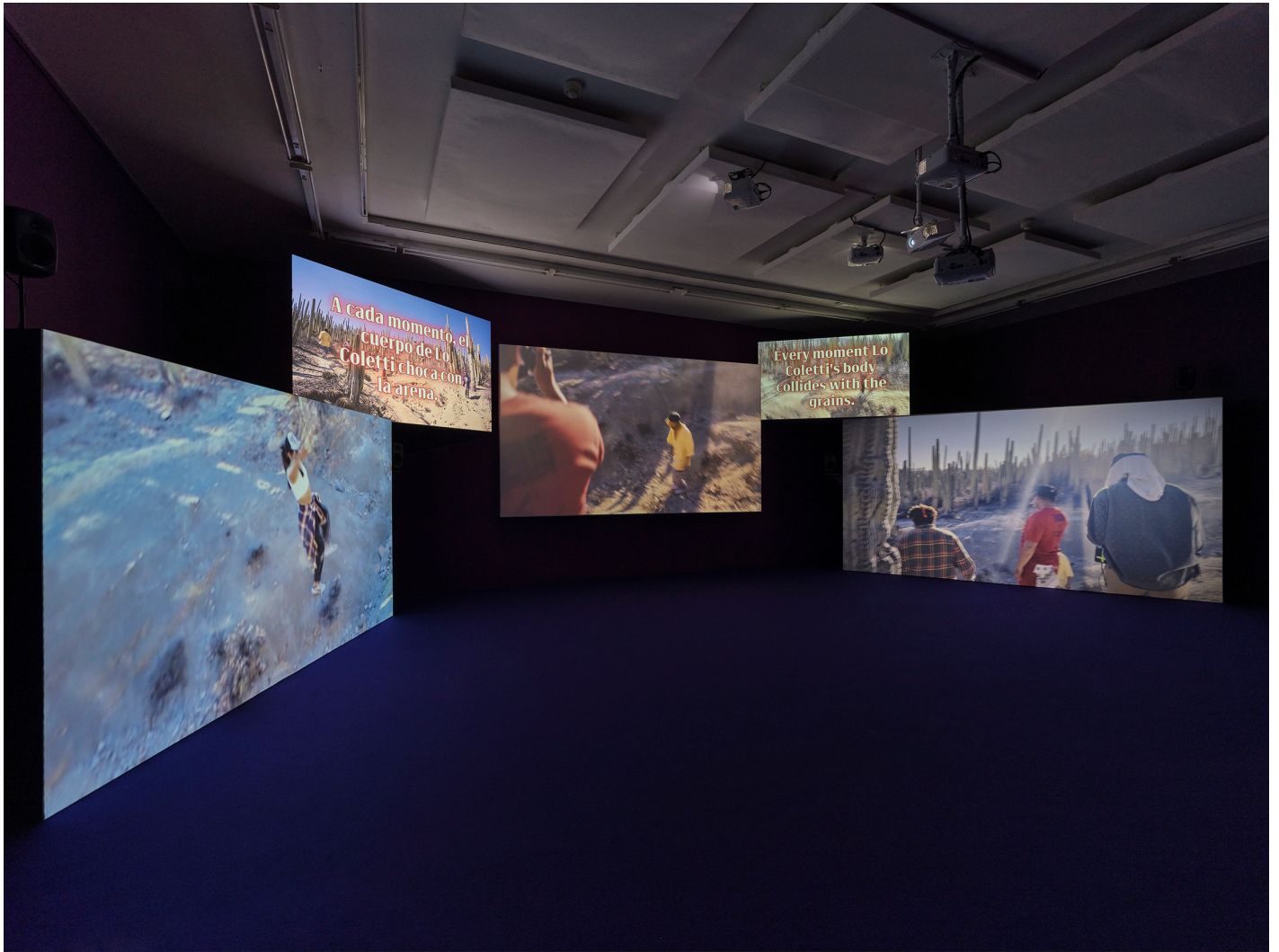
AMOXTLI (CAMERA SERPENT). 2024. INSTALLATION VIEW IN LA VOIX DES FLEUVES. CROSSING THE WATER. LA BIENNALE DE LYON. LYON.