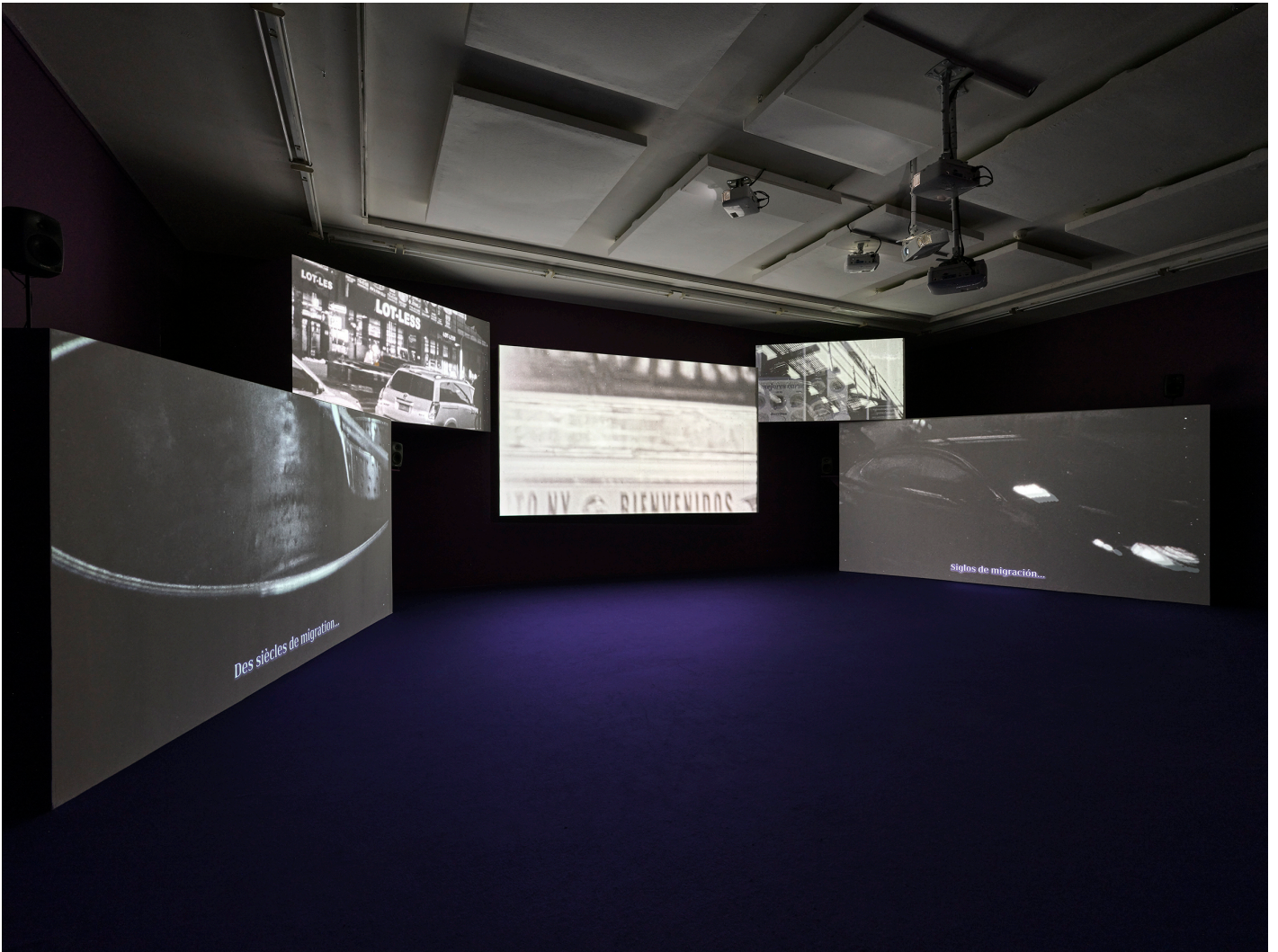
AMOXTLI (EVERYWHERE MY BROWN SHOE STEPS). 2024. INSTALLATION VIEW IN LA VOIX DES FLEUVES. CROSSING THE WATER. LA BIENNALE DE LYON. LYON.