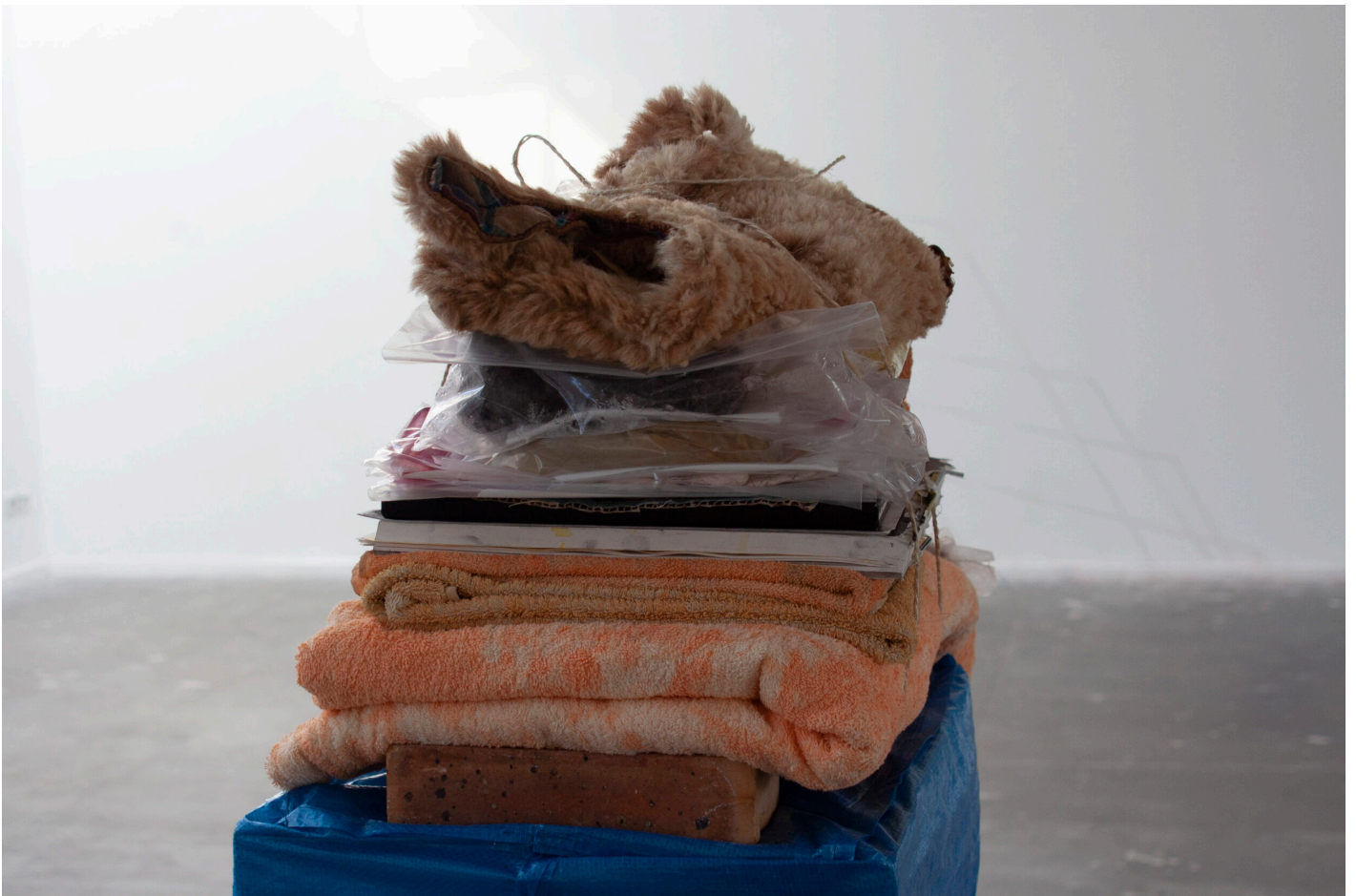
INSTALLATION VIEWS AND DETAILS OF WORKS BY VIR ANDRES HERA DURING RUNDGANG AT UNIVERSITÄT DER KÜNSTE, BERLIN, 2014