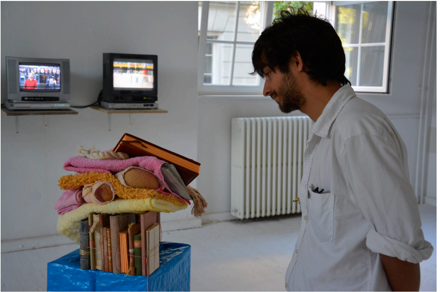
INSTALLATION VIEWS AND DETAILS OF WORKS BY VIR ANDRES HERA DURING RUNDGANG AT UNIVERSITÄT DER KÜNSTE, BERLIN, 2014