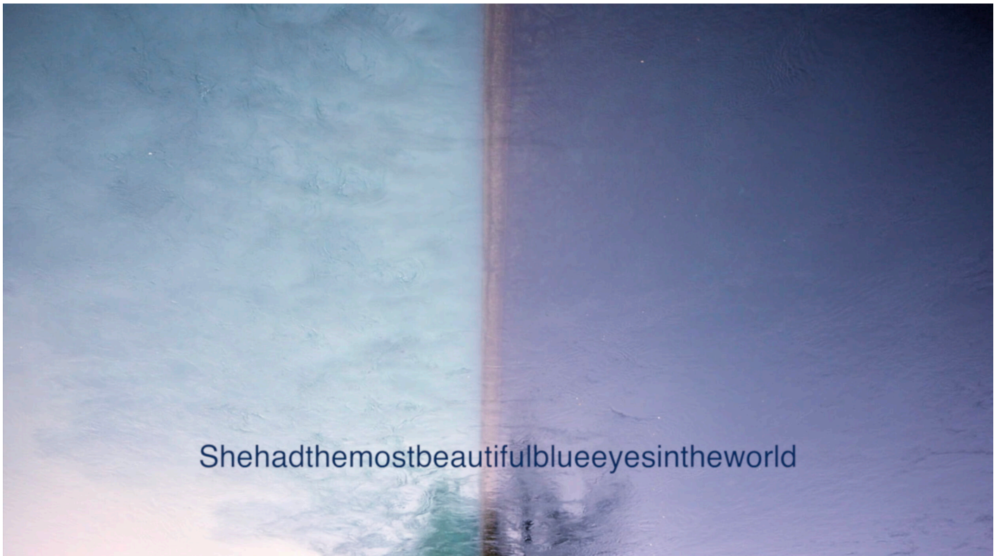
BLUE BLEU. VIDEO HD. 2016.

Translation is partial, recursive, and often excessive. Meaning slips between languages, producing a texture of misunderstanding and resonance. The work does not attempt to define a color, but approaches it as a moving threshold, a chromatic fiction shaped by perception, history, and power.