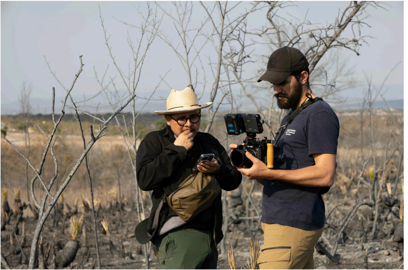
FIELD RECORDING DURING AMOXTLI.