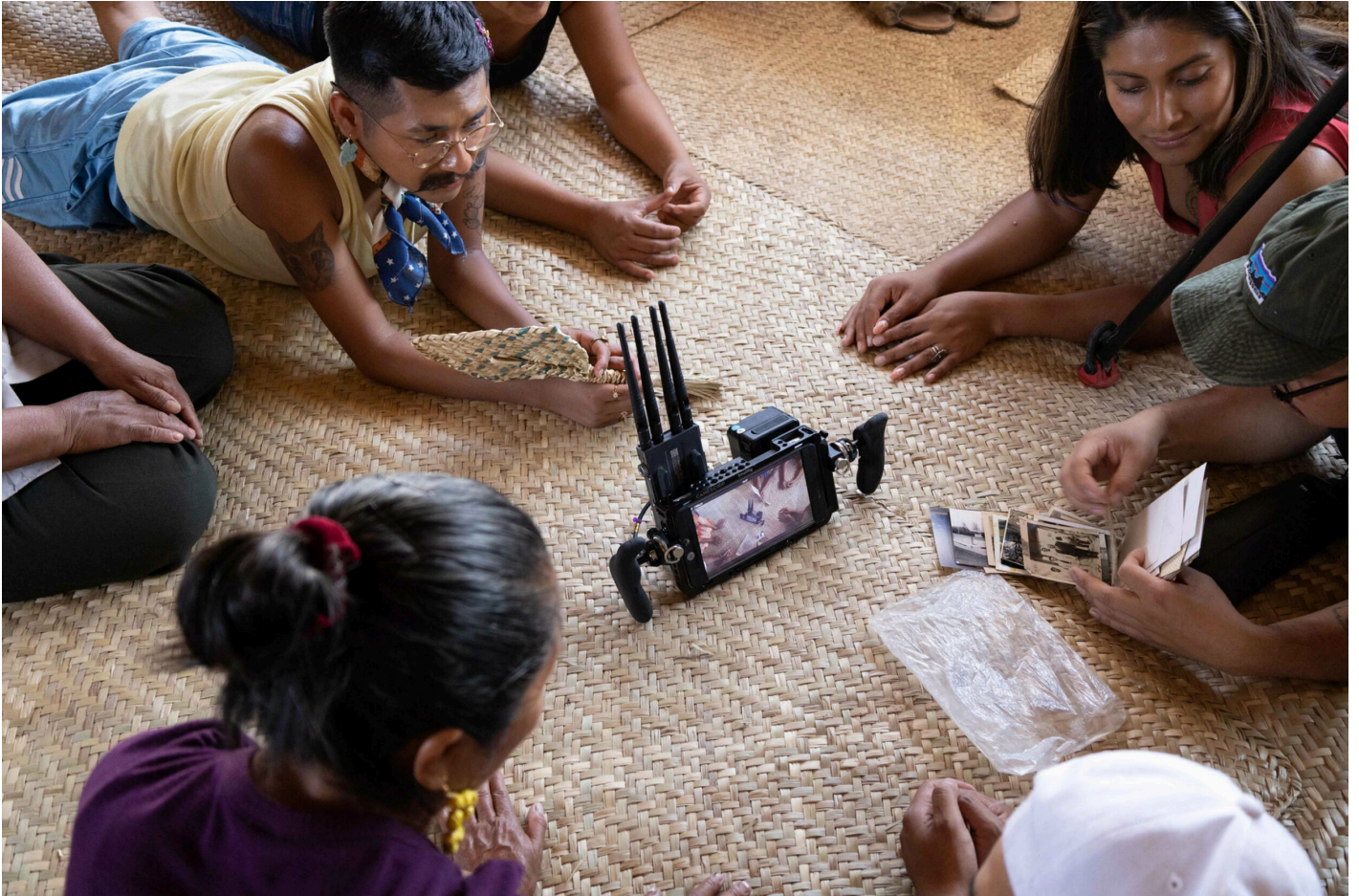
COMMUNITY SPACE, CHASEN THAJNI.