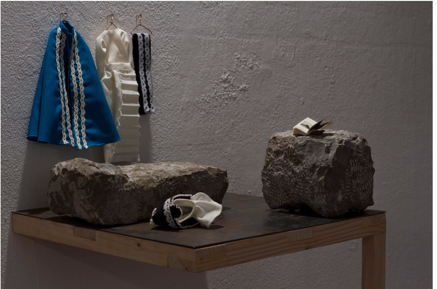
EL TALLER ES UNA NUBE. INSTALLATION VIEW. 2015