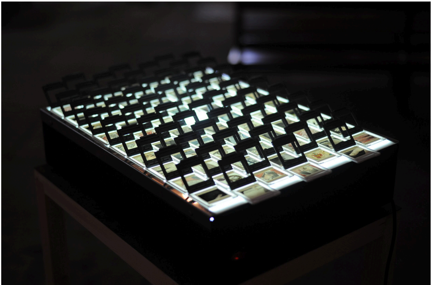
THE SUPPRESSED FILM ARCHIVE, INSTALLATION VIEW. 2015

A set of hand-made watercolor miniatures, placed in slide frames, reproduces details extracted from religious iconographies. Gestures, ornaments, fragments of skin, peripheral elements. The whole points to what has been omitted, displaced, or rendered secondary.