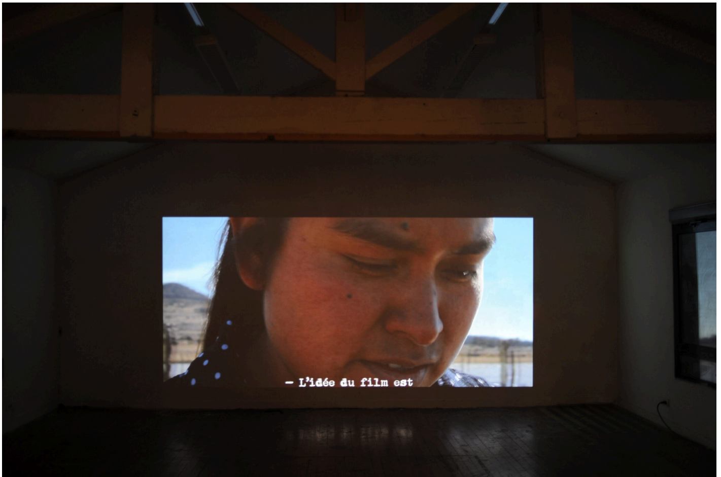
TALAVERESCO (SUBTITLES). INSTALLATION VIEW. 2015