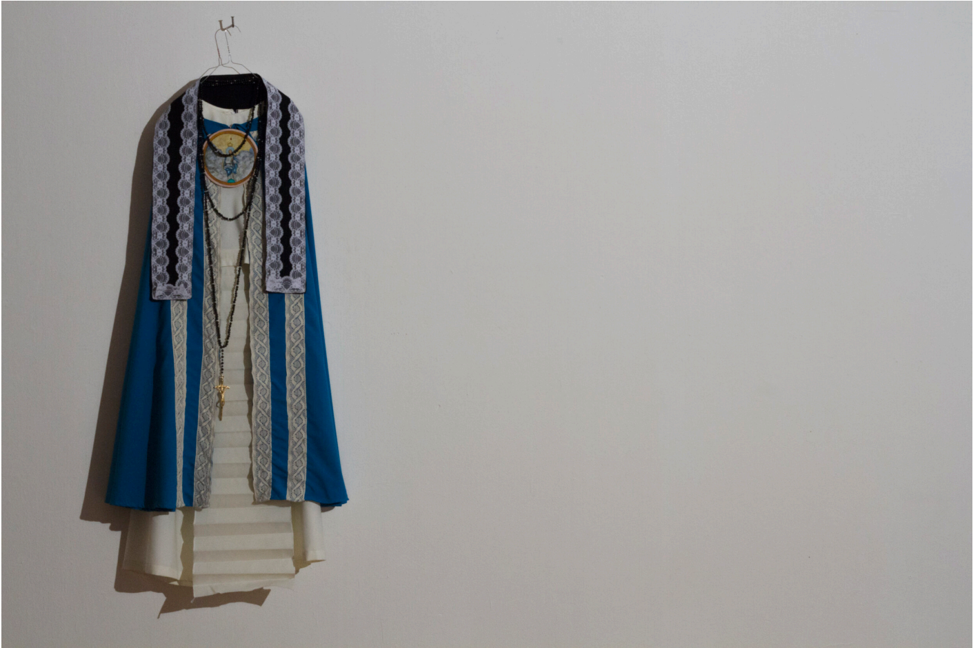
NACHA. INSTALLATION VIEW. COURTESY OF THE ARTIST. 2015

An installation composed of stones, miniaturized objects, and a costume derived from religious colonial depictions of monjas coronadas. The scales do not correspond. The body never appears as a whole. It is distributed, displaced, reconstructed through fragments.