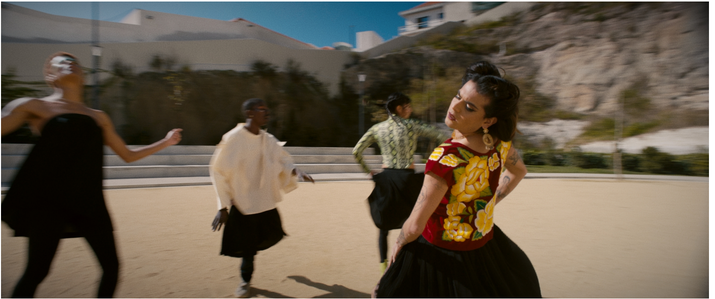
AND THE CATEGORY IS: FACE! VIR ANDRES HERA. 2023. FROM THE INSTALLATION LE DAFTAR, 2023. PRODUCTION: MÉCÈNES DU SUD MONTPELLIER-SÈTE-BÉZIERS & CHINAMPA.