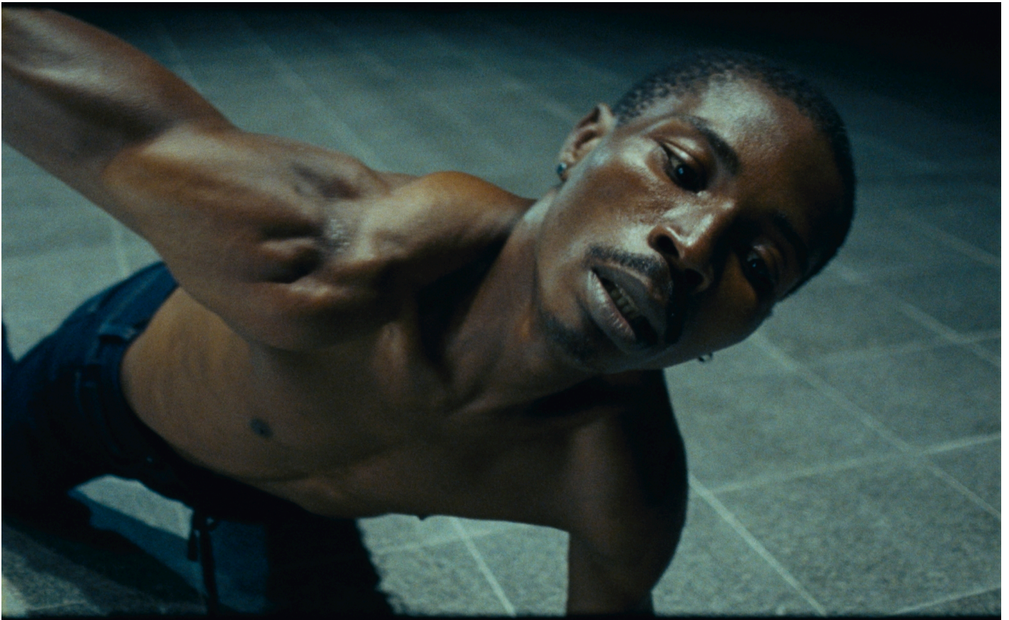
A FIRE BURNS UNDER A PAVEMENT. IN AN ALLEY. VIR ANDRES HERA. 2023. FROM THE INSTALLATION LE DAFTAR, 2023. PRODUCTION: MÉCÈNES DU SUD MONTPELLIER-SÈTE-BÉZIERS & CHINAMPA.