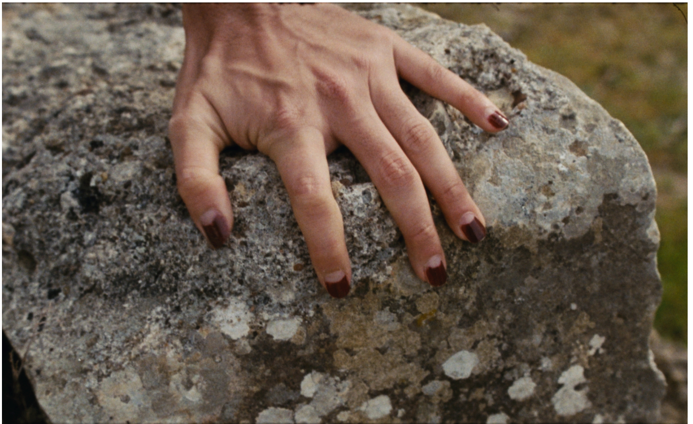
KÉTÉ-KÉTÉ. VIR ANDRES HERA. 2023. FROM THE INSTALLATION LE DAFTAR, 2023. PRODUCTION: MÉCÈNES DU SUD MONTPELLIER-SÈTE-BÉZIERS & CHINAMPA.