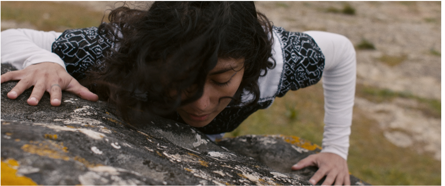
UNIX VUELVE SIEMPRE. VIR ANDRES HERA. 2022. FROM THE INSTALLATION LE DAFTAR, 2023. PRODUCTION: MÉCÈNES DU SUD MONTPELLIER-SÈTE-BÉZIERS & CHINAMPA. COURTESY OF CHINAMPA.