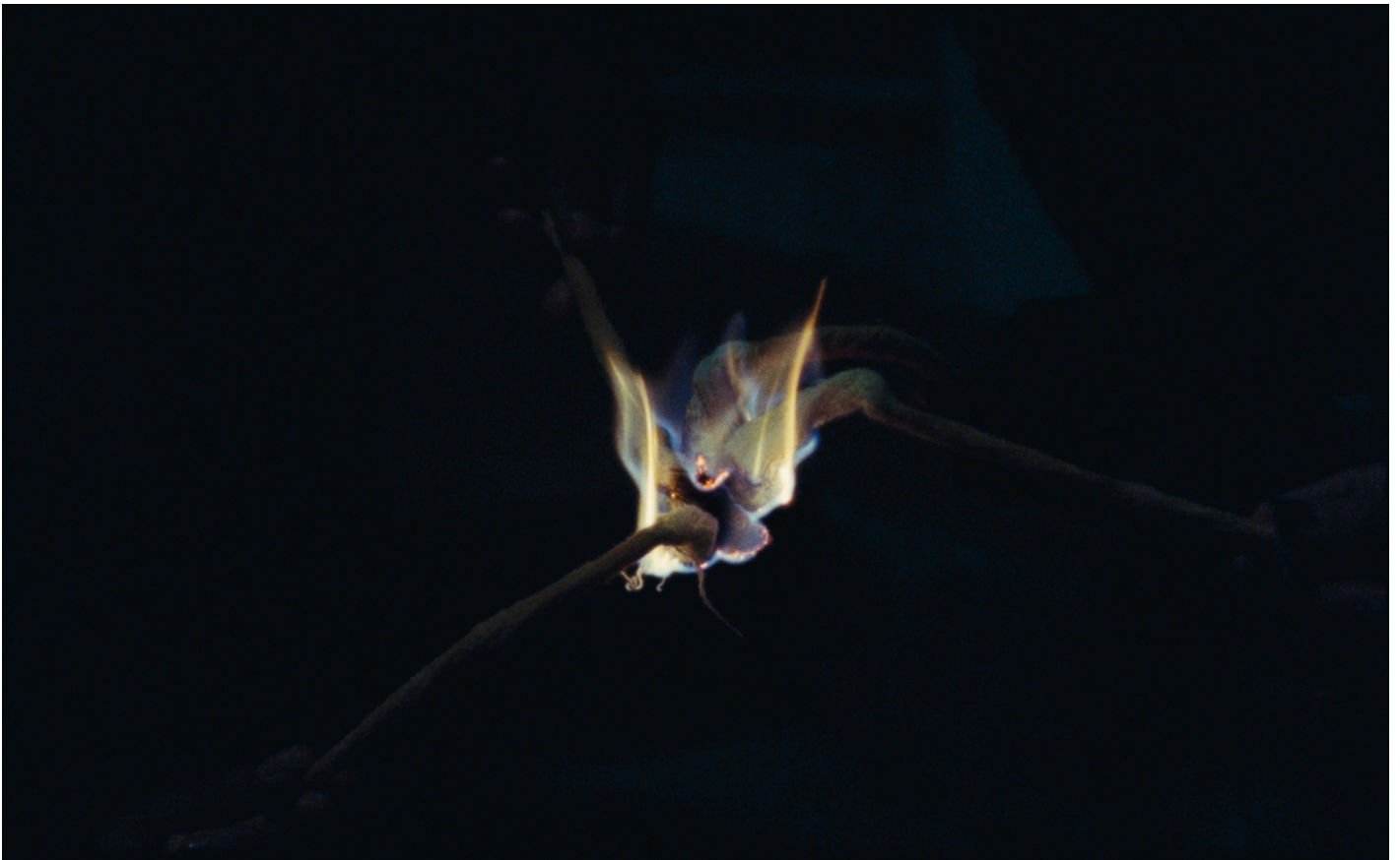
A FIRE BURNS UNDER A PAVEMENT. IN AN ALLEY. VIR ANDRES HERA. 2023. FROM THE INSTALLATION LE DAFTAR, 2023. PRODUCTION: MÉCÈNES DU SUD MONTPELLIER-SÈTE-BÉZIERS & CHINAMPA.