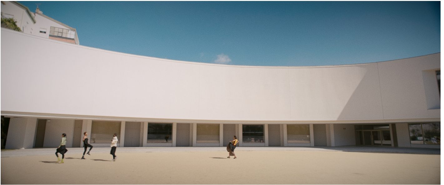
AND THE CATEGORY IS: FACE! VIR ANDRES HERA. 2023. FROM THE INSTALLATION LE DAFTAR, 2023. PRODUCTION: MÉCÈNES DU SUD MONTPELLIER-SÈTE-BÉZIERS & CHINAMPA.