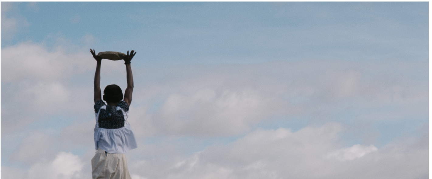
UNX VUELVE SIEMPRE. VIR ANDRES HERA. 2022. FROM THE INSTALLATION LE DAFTAR, 2023. PRODUCTION: MÉCÈNES DU SUD MONTPELLIER-SÈTE-BÉZIERS & CHINAMPA.