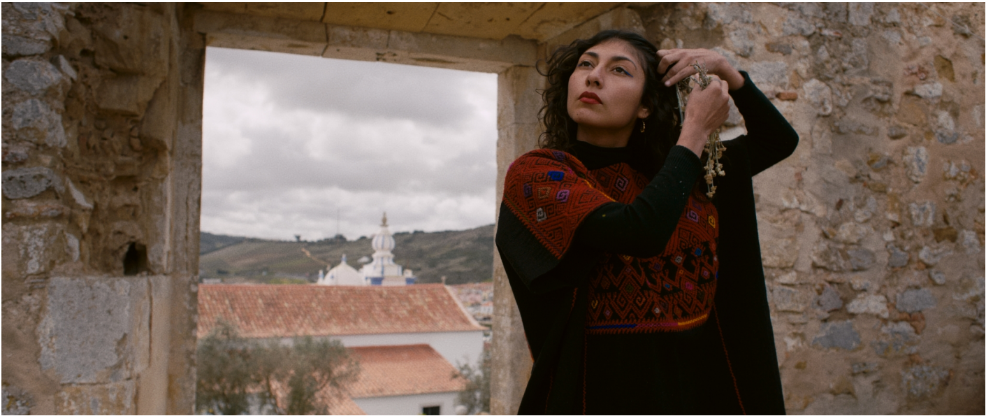
KÉTÉ-KÉTÉ. VIR ANDRES HERA. 2023. FROM THE INSTALLATION LE DAFTAR, 2023. PRODUCTION: MÉCÈNES DU SUD MONTPELLIER-SÈTE-BÉZIERS & CHINAMPA.