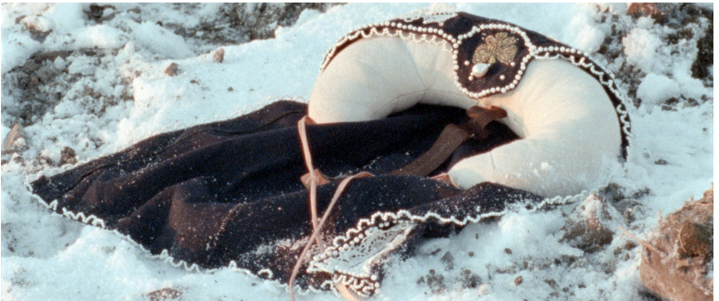
ALL IMAGES: LE ROMANZ DE FANUEL. DIGITAL STILLS FROM 16 MM FILM TRANSFERRED TO DIGITAL. VIR ANDRES HERA, 2017.