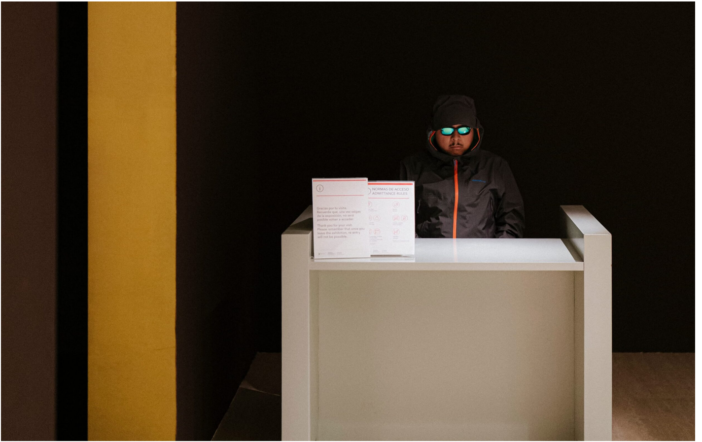
ALL IMAGES: LO SAGRADO, SIN MUNDO, MUSEO NACIONAL THYSSEN-BORNEMISZA, MADRID, 2026.