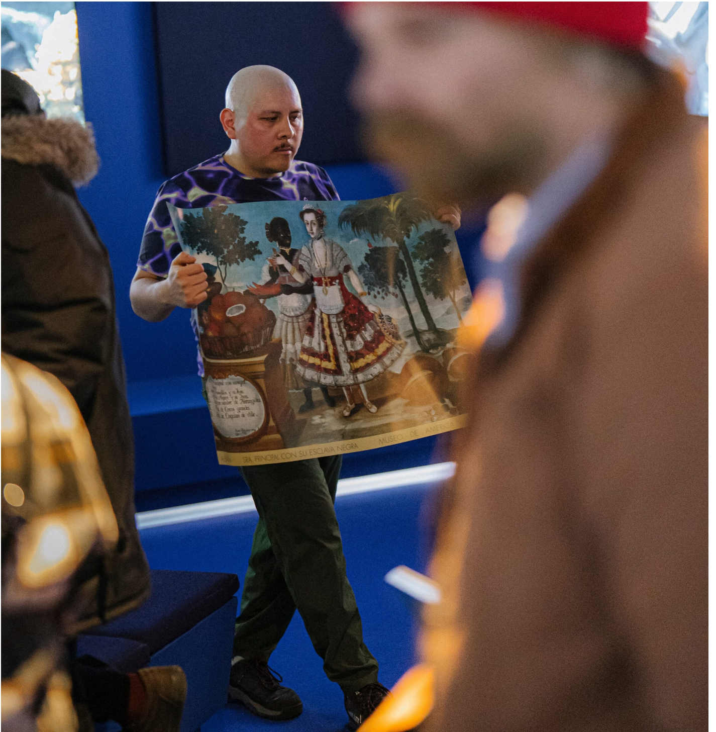
PRESENTING SEÑORA PRINCIPAL CON SU ESCLAVA BY VICENTE ALBÁN DURING THE PERFORMANCE, MUSEO NACIONAL THYSSEN-BORNEMISZA, 2026. COURTESY OF MUSEO NACIONAL THYSSEN-BORNEMISZA. MARU SERRANO.