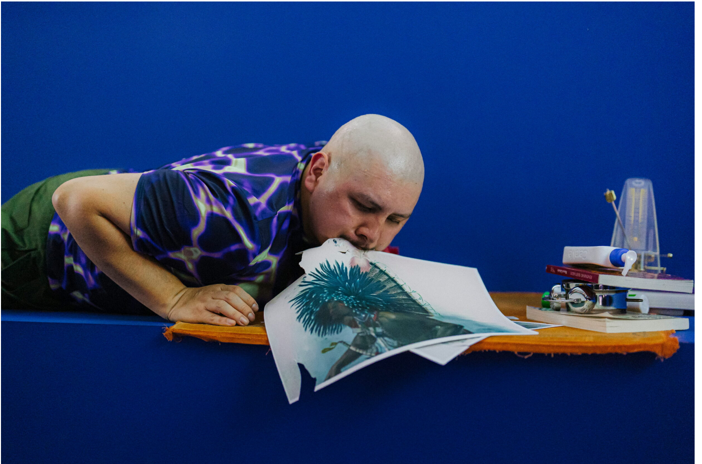
INGESTING A REPRODUCTION OF PEHRISKA RUPA (TWO CROWS, THE YOUNGER) BY GEORGE CATLIN, MUSEO NACIONAL THYSSEN-BORNEMISZA, 2026. COURTESY OF MUSEO NACIONAL THYSSEN-BORNEMISZA. MARU SERRANO.