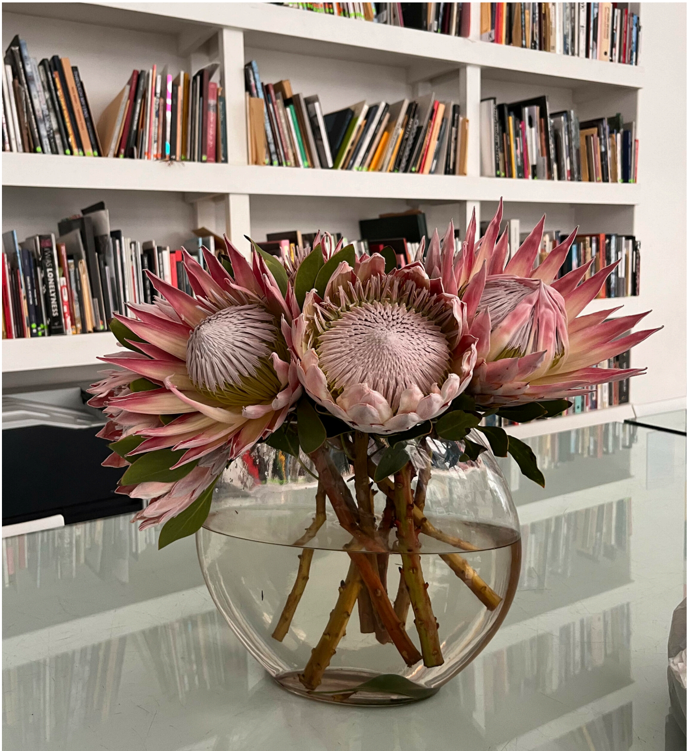
PROTEA FLOWERS, A SYMBOL OF SOUTH AFRICA