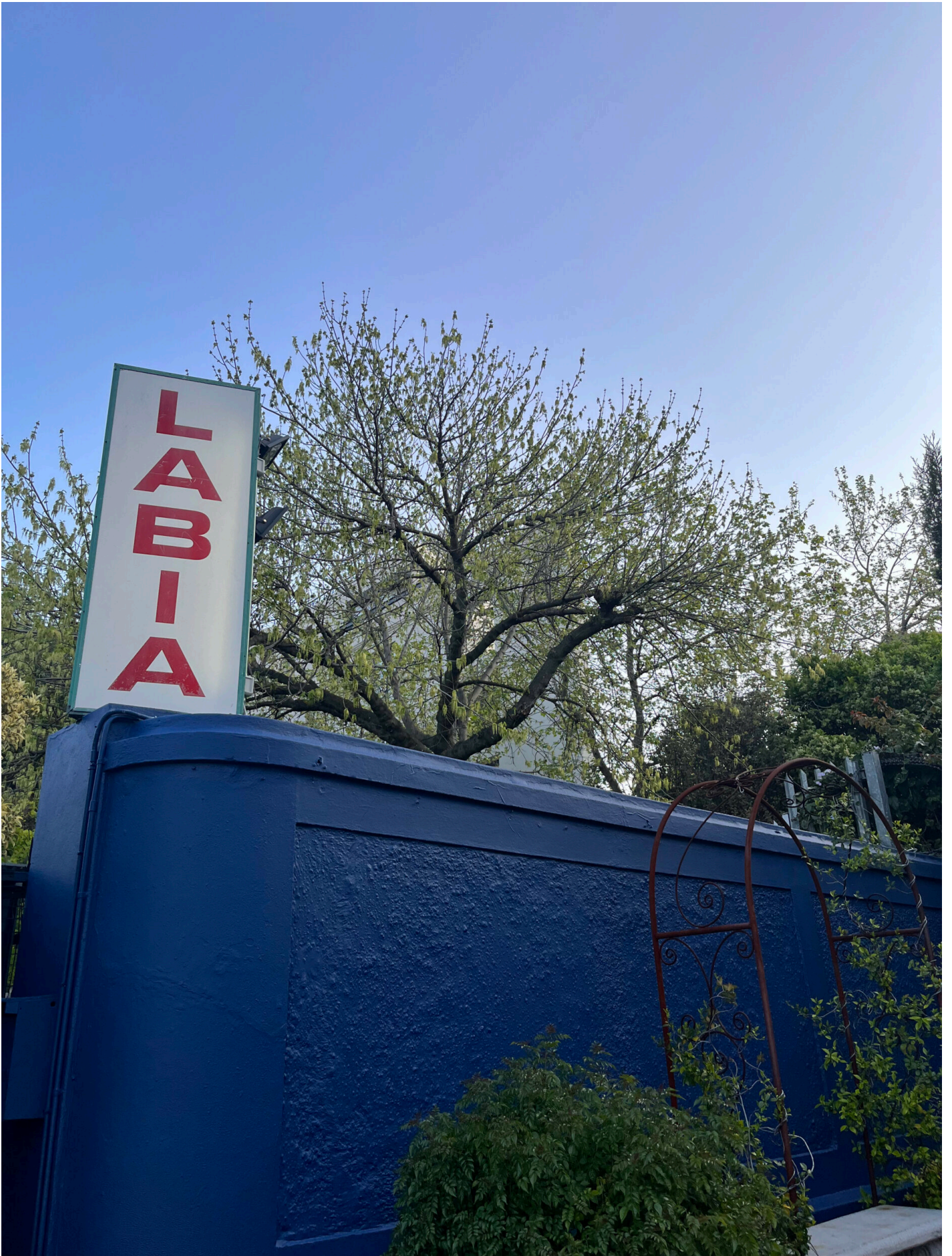
LABIA CINEMA SIGN