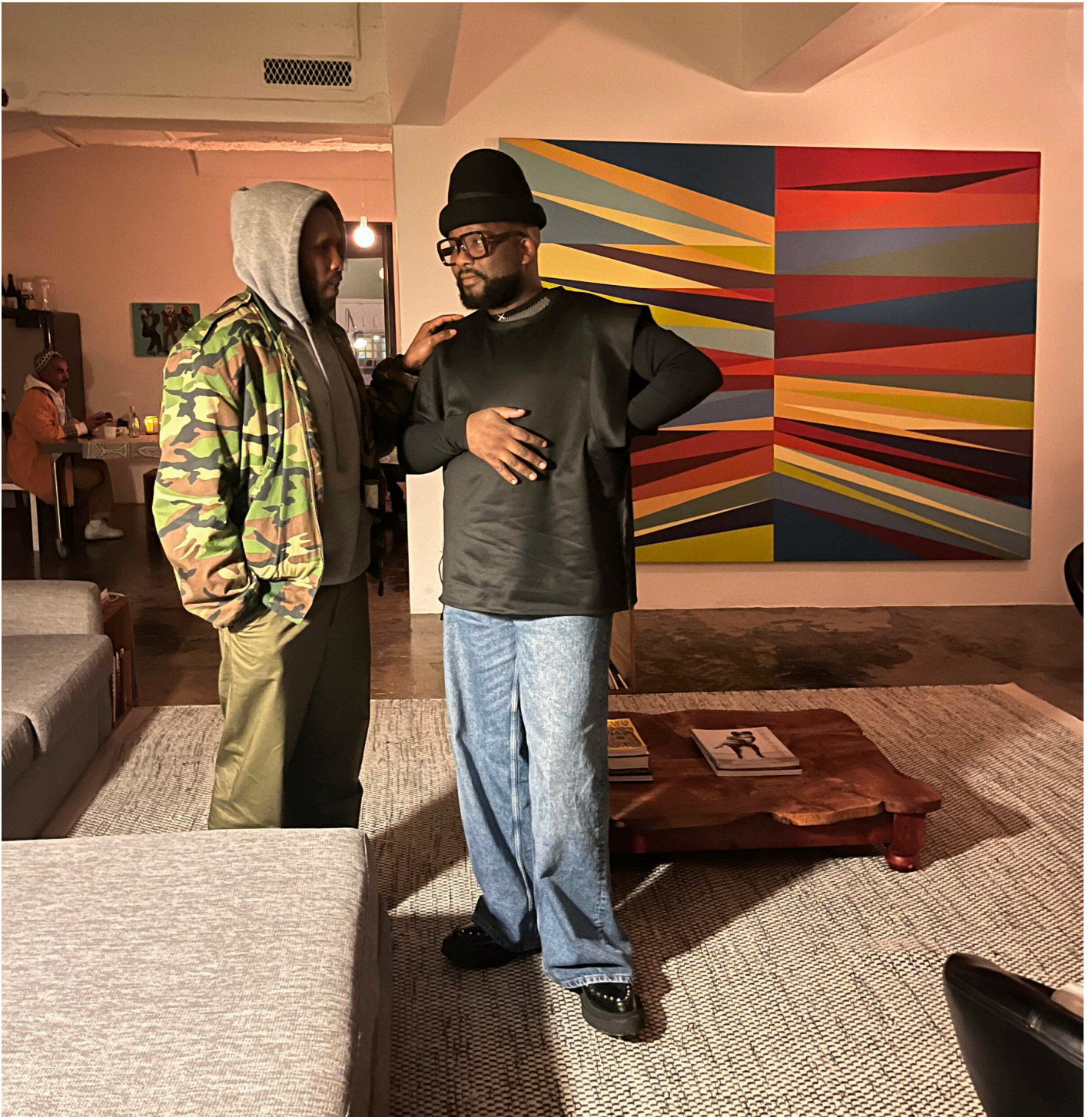
CONVERSATION IN THE RESIDENCY SPACE

During this period, particular attention was given to the linguistic dynamics discussed in Race, Nation, Translation: South African Essays (1990–2013) and to the reflections of South African writer Zoe Wicomb on translation, language politics, and post-apartheid cultural identity. These questions resonate with the artist's ongoing research on the relations of power, friction, and transformation between languages across mythologies, histories, and geographies.