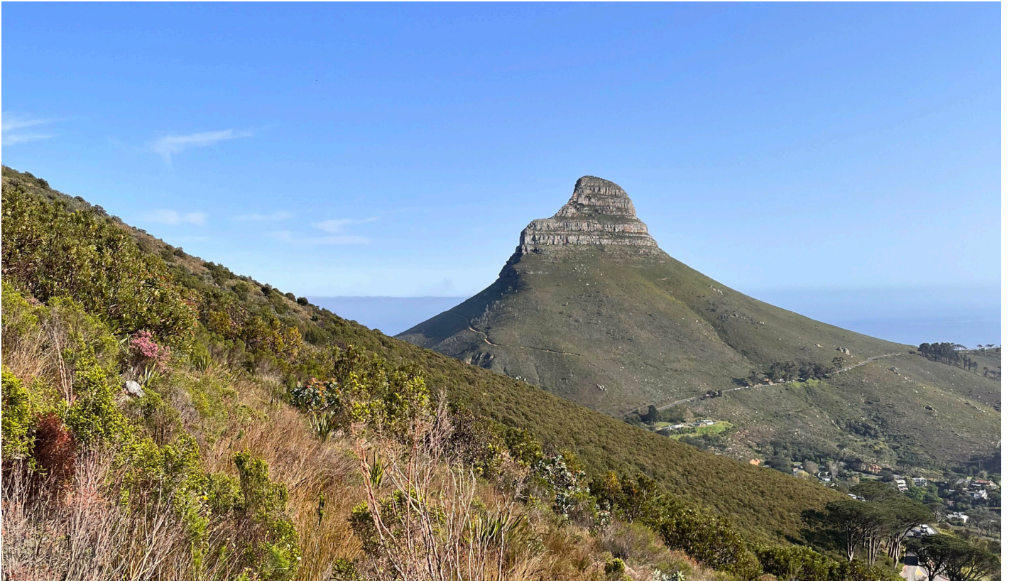
LION'S HEAD MOUNTAIN LANDSCAPE

This residency, titled Los Coyotes Entraron en su Siglo borrows a phrase from Elena Garro's short story La culpa es de los tlaxcaltecas , where temporal fractures between the colonial conquest and the present destabilize official histories. It took place during a one-month stay in Cape Town hosted by Breaking Bread and Art and Ubuntu Trust, unfolding around questions of language, translation, and colonial memory.