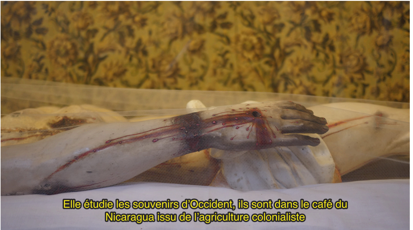
Elle étudie les souvenirs d'Occident, ils sont dans le café du Nicaragua issu de l'agriculture colonialiste