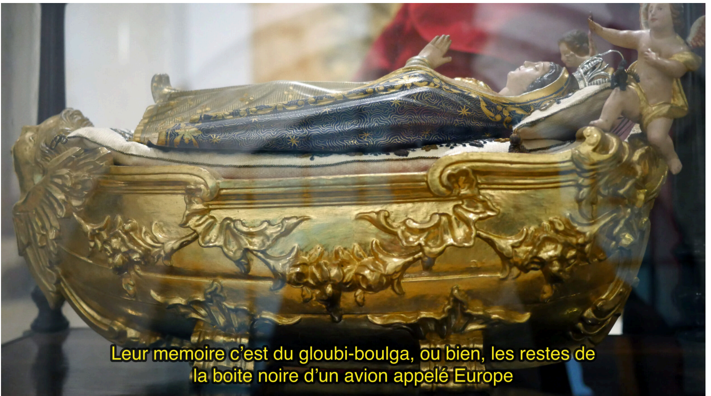
Leur memoire c'est du gloubi-boulga, ou bien, les restes de la boite noire d'un avion appelé Europe