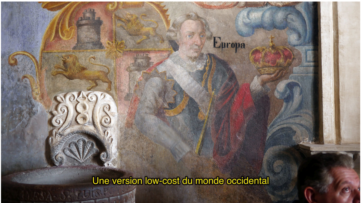
Une version low-cost du monde occidental