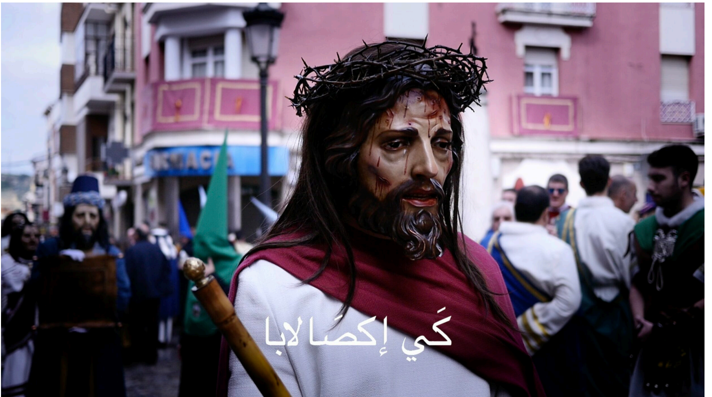
ALL FILM STILLS: PIRAMIDAL 2020, پيراميدال.