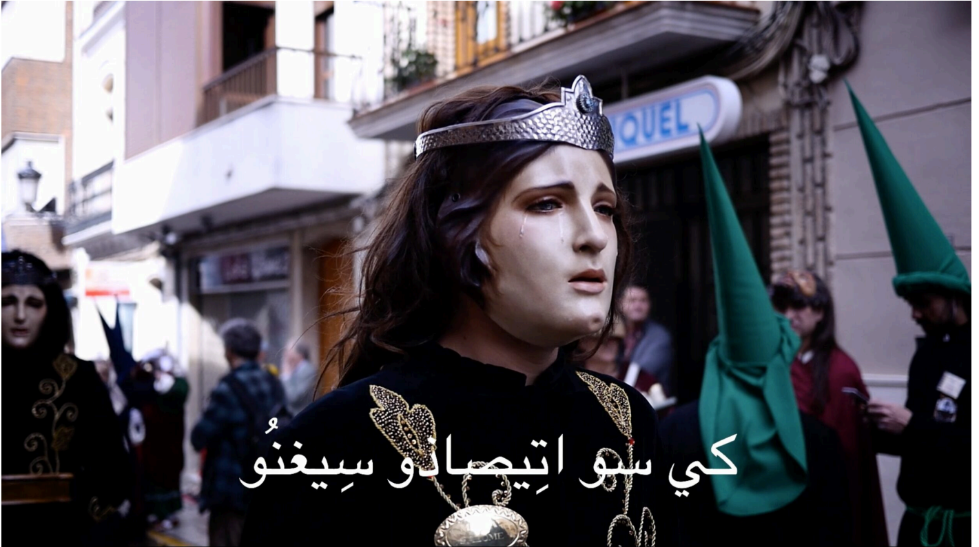
PIRAMIDAL بىراميدال - FILM EXCERPT

Initially conceived as a retable installation and later reworked as a film.