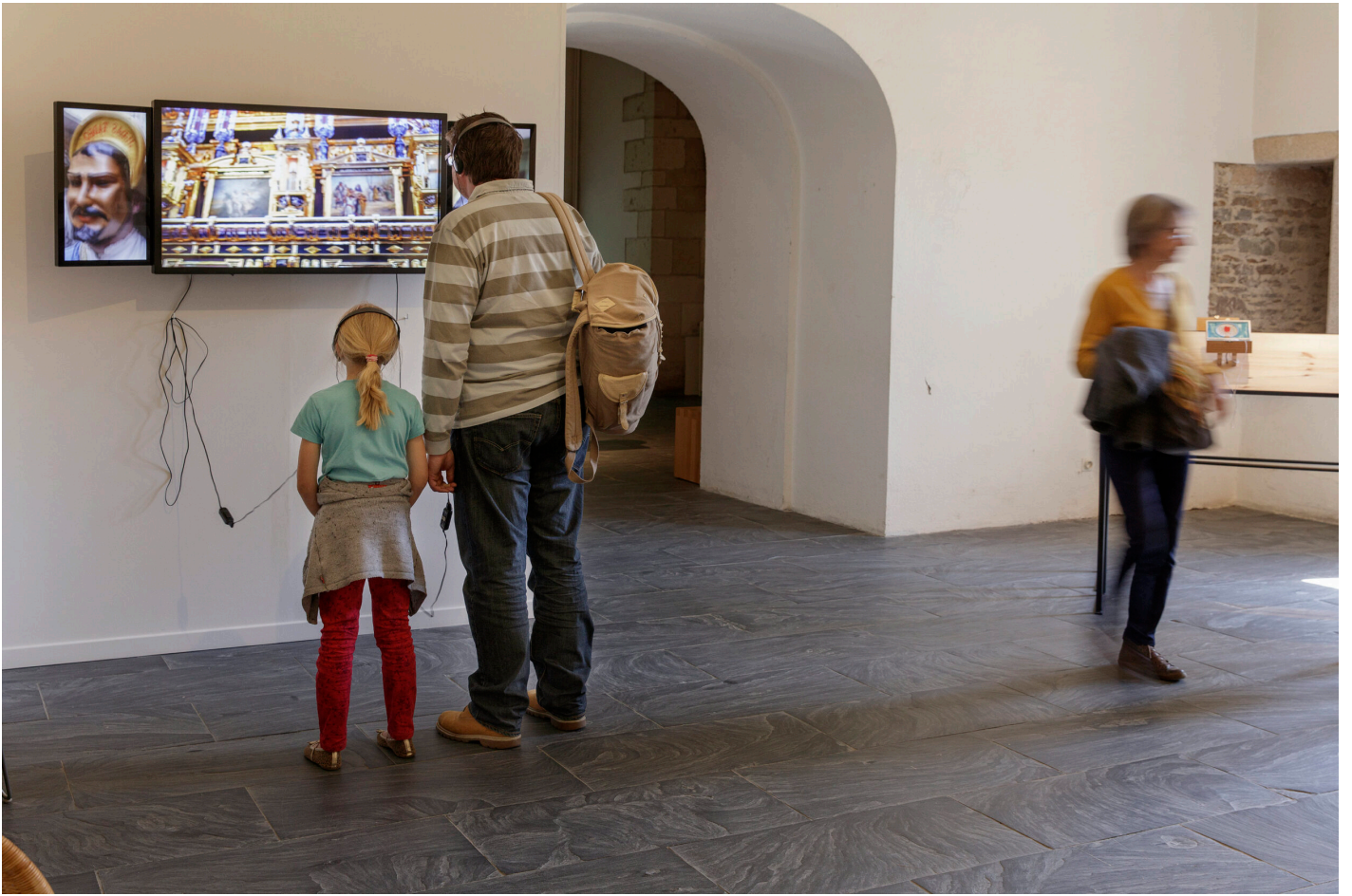
INSTALLATION VIEW, ITINÉRANCIA NANTES, MUSÉE DOBRÉE, 2017.