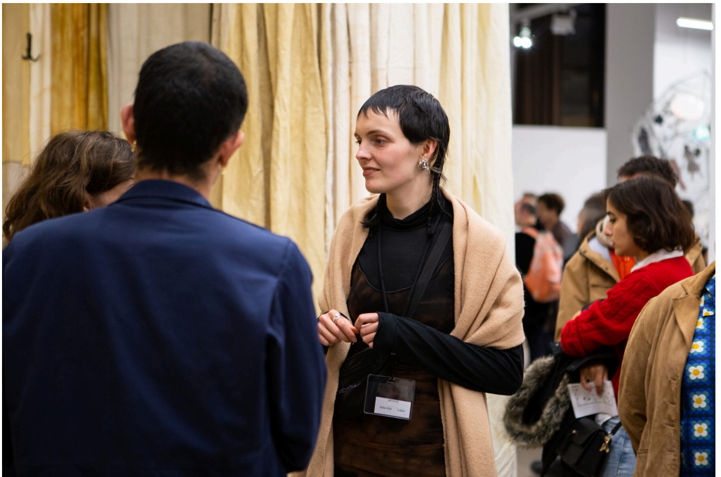
VIEW OF THE OPENING, AËLA MAÉ CABEL; SALON DE MONTROUGE 2022.

As articulated in a text by Eva Barois De Caevel written for the Salon de Montrouge 2022 catalogue: “Hera’s practice unfolds from interstitial spaces between languages, bodies, and territories, reworking fragments of language and history in order to question inherited narratives and colonial legacies. This attention to relational processes and emancipatory imaginaries situates their work within a practice of listening, where voices, memory, and translation remain in constant negotiation.” [1]