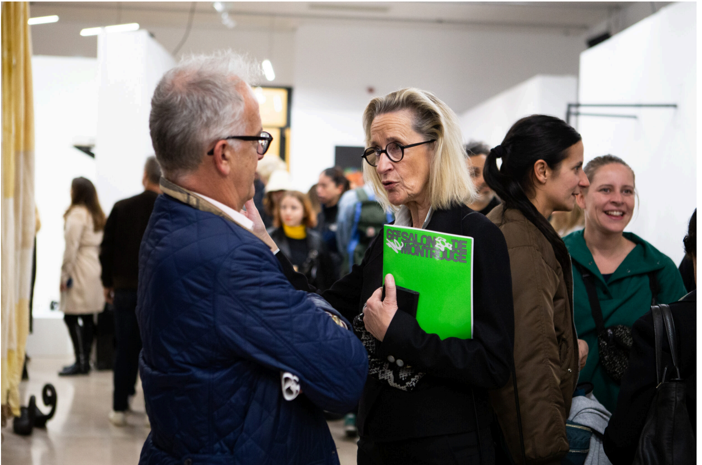
VIEW OF THE OPENING, VISITOR WITH THE EXHIBITION CATALOGUE, SALON DE MONTROUGE 2022.