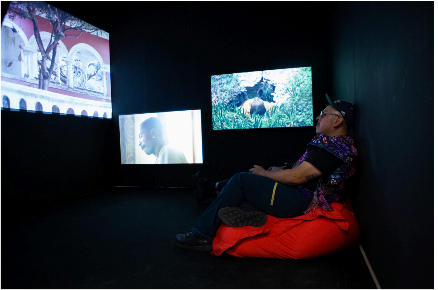
VIEWS OF THE INSTALLATION LE DAFTAR (WORK-IN-PROGRESS VERSION), SALON DE MONTRouGE 2022. PHOTO: ZOÉ CHAUVET / WORK METHOD.