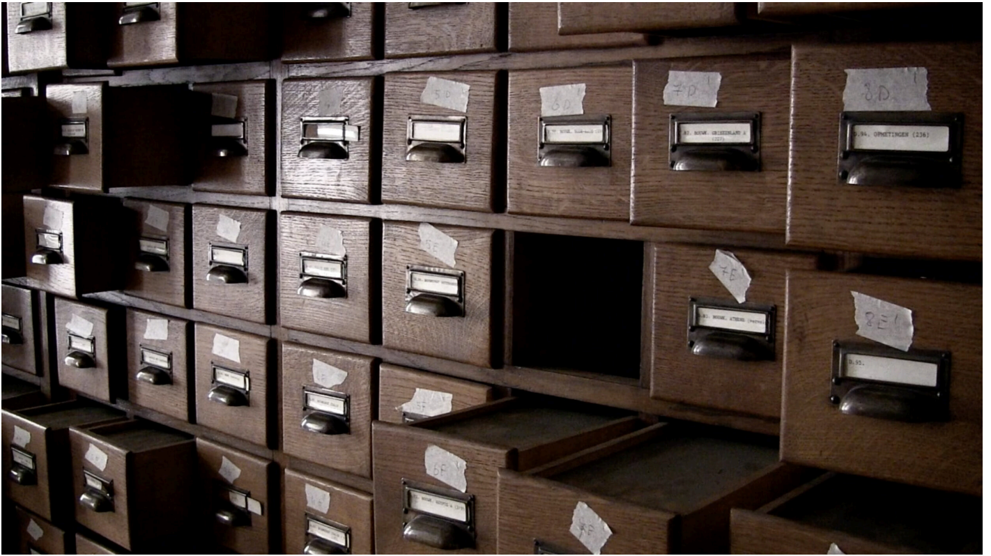
FRENCH CHAU. VIDEO STILL, HD. 2014.