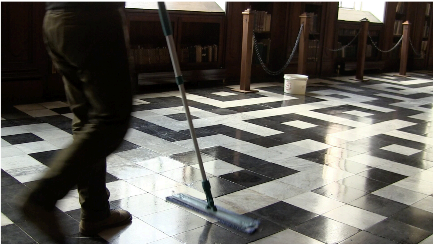
CLINIC CLEANING. VIDEO STILL, HD. 2014.