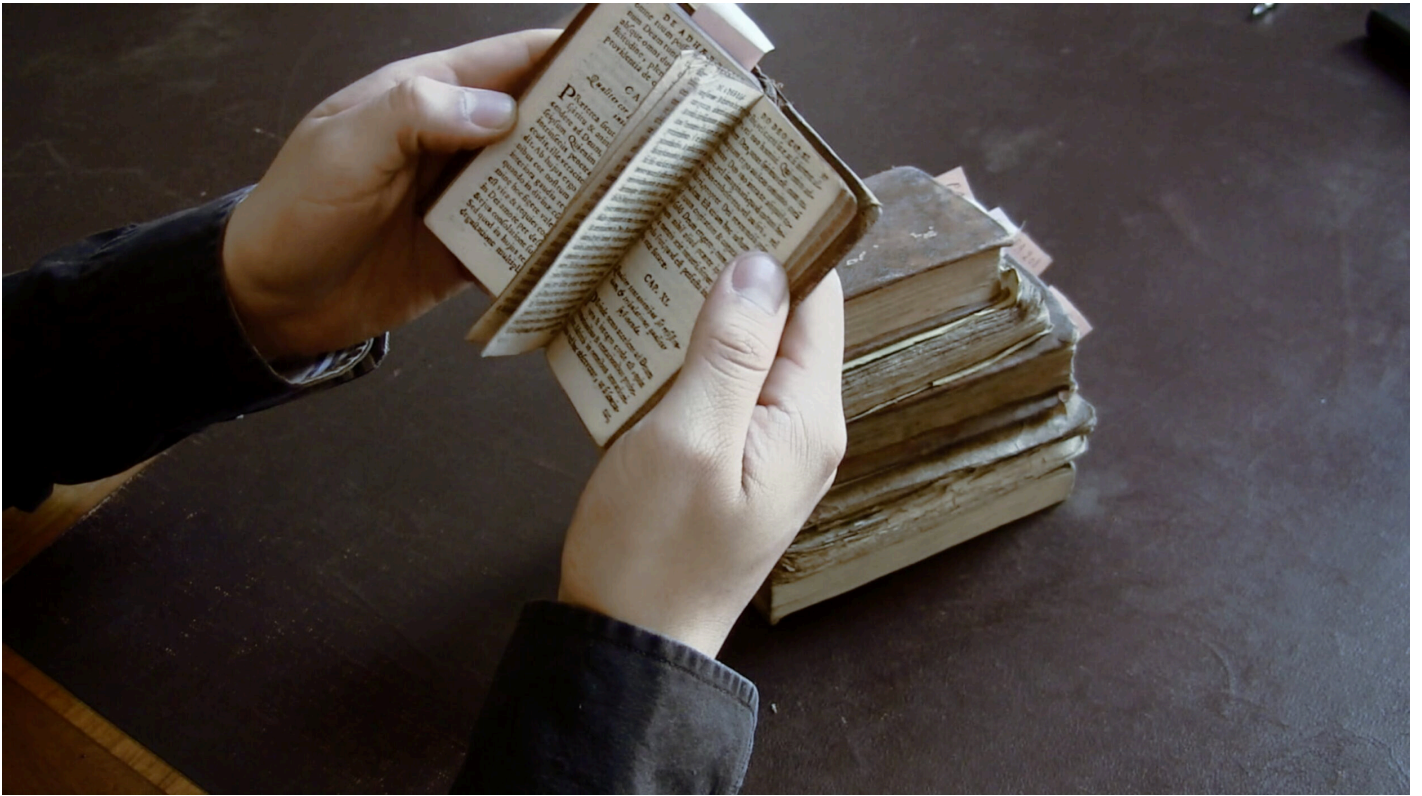
SECONDE JEUNESSE. VIDEO STILL, HD. 2015.