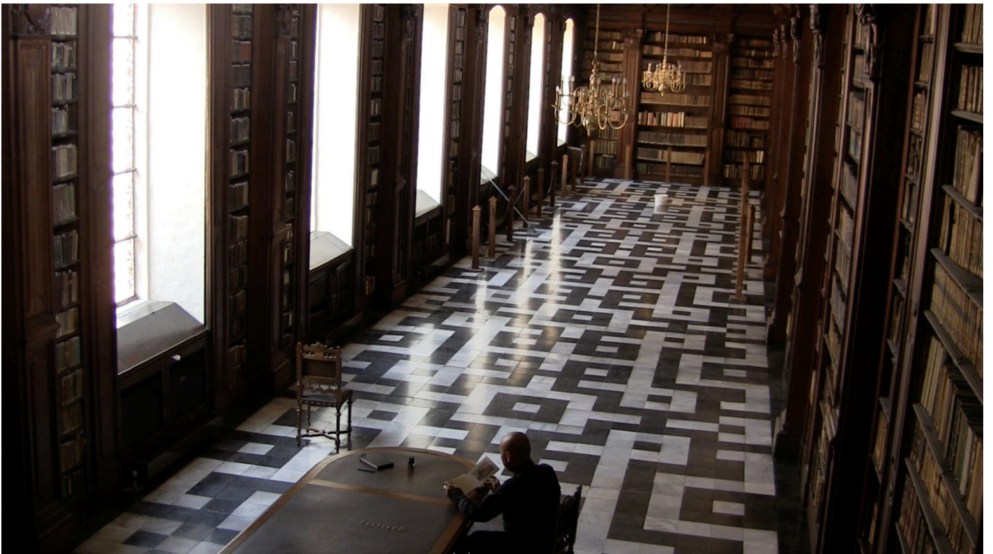
SECONDE JEUNESSE. VIDEO STILL, HD. 2015.