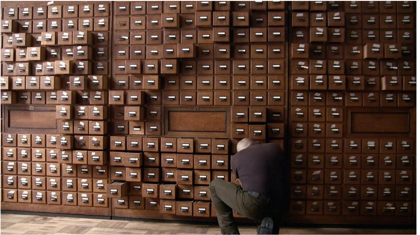
FRENCH CHAV. VIDEO STILL, HD. 2014.