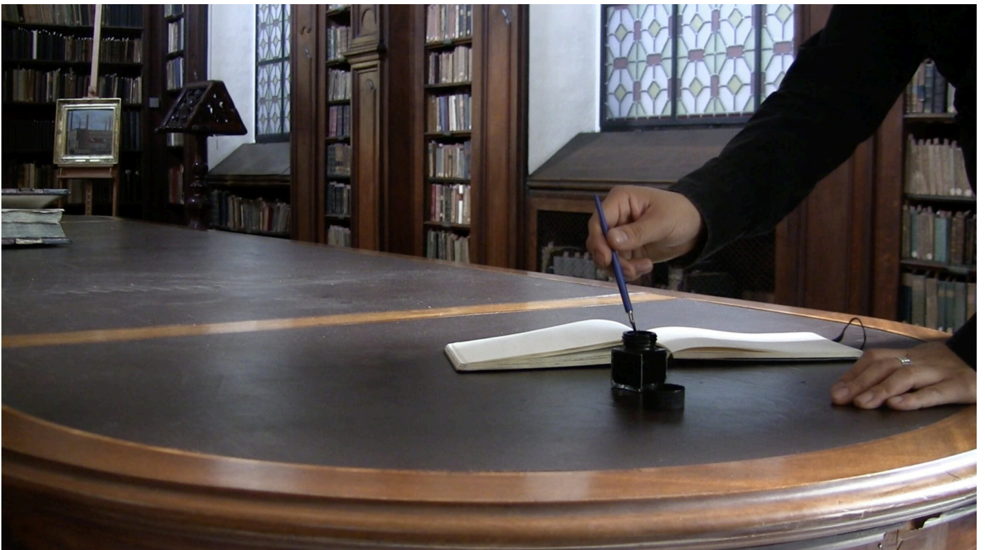
SECONDE JEUNESSE. VIDEO STILL, HD. 2015.