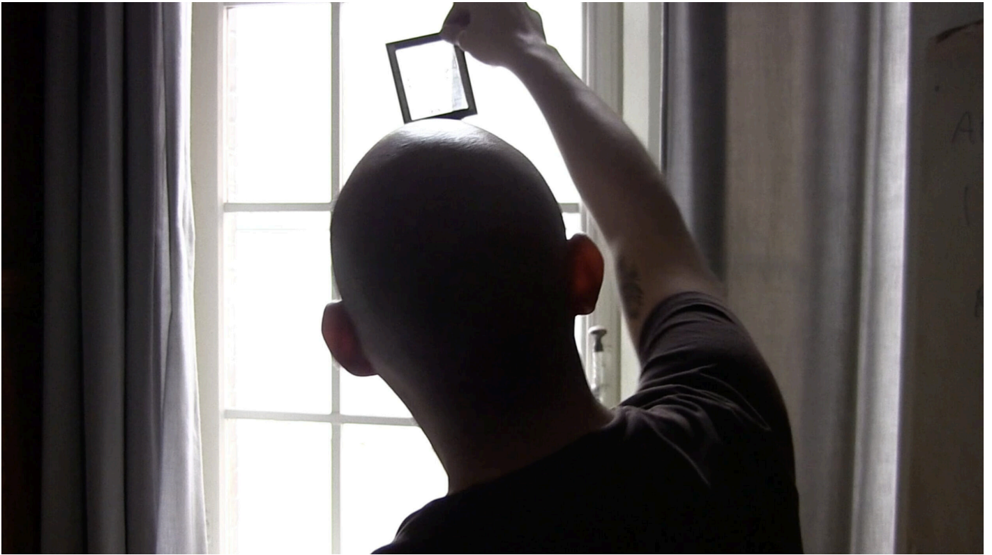
FRENCH CHAV. VIDEO STILL, HD. 2014.