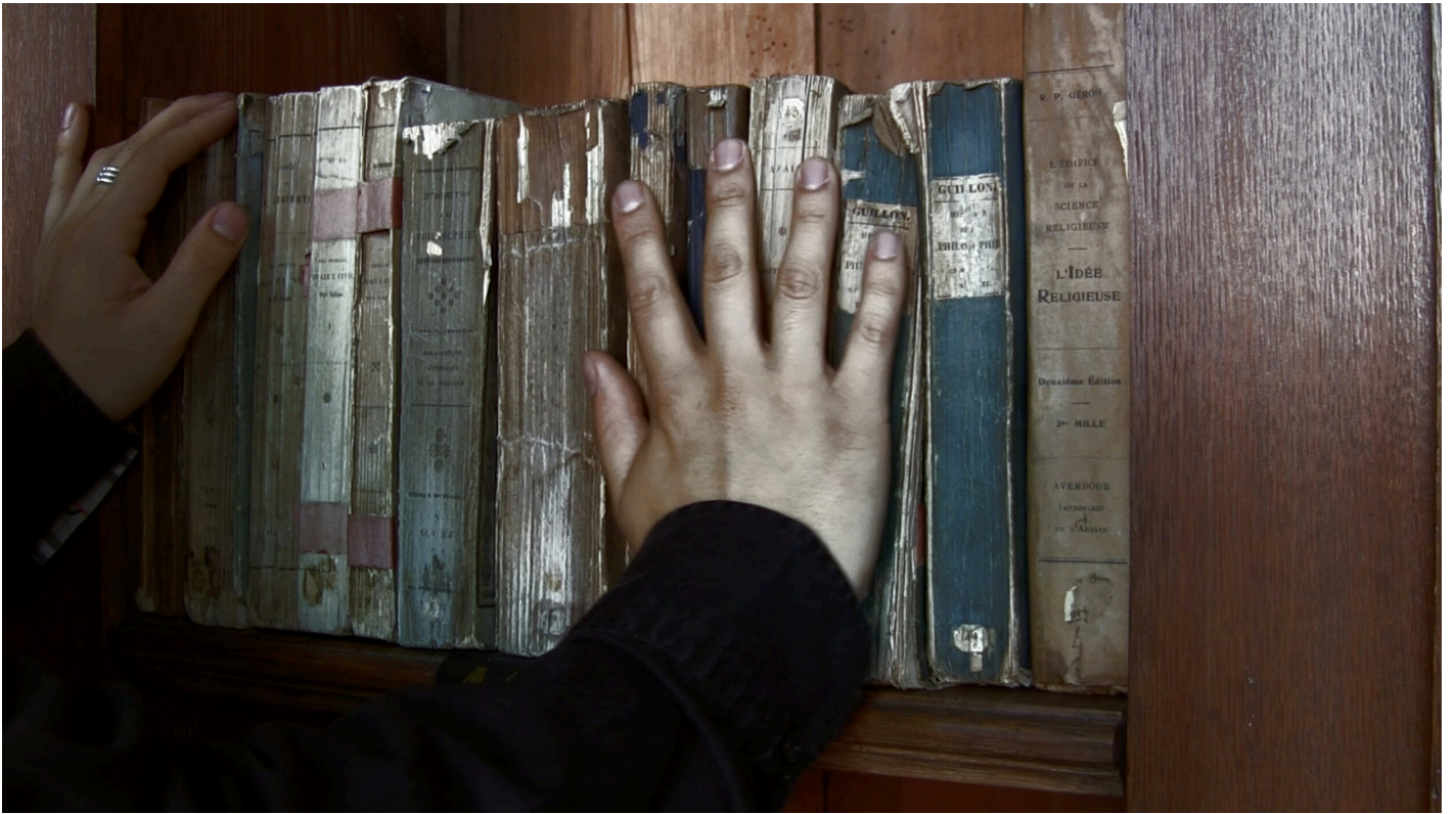
SECONDE JEUNESSE. VIDEO STILL, HD. 2015.