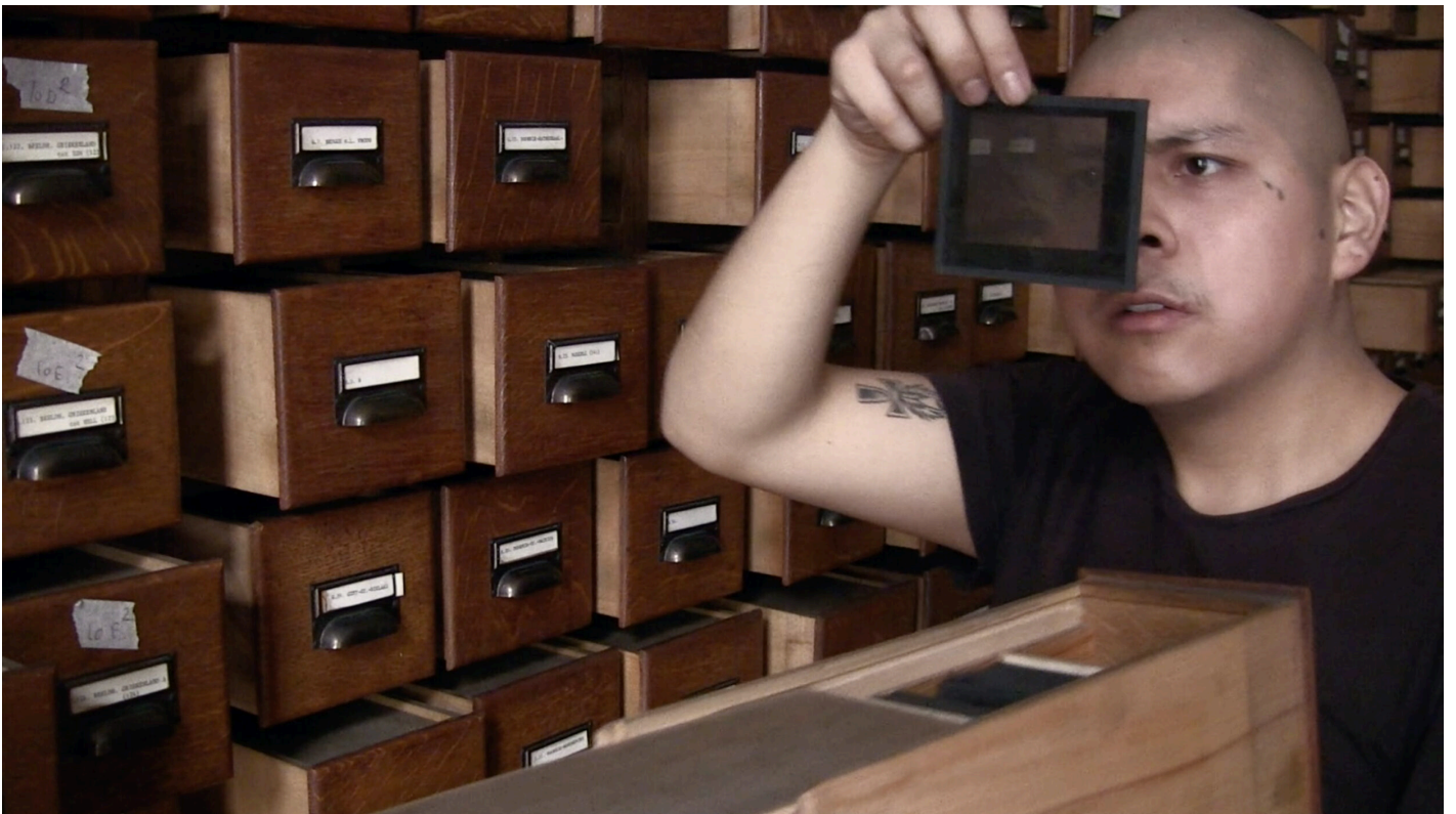
FRENCH CHAU. VIDEO STILL, HD. 2014.