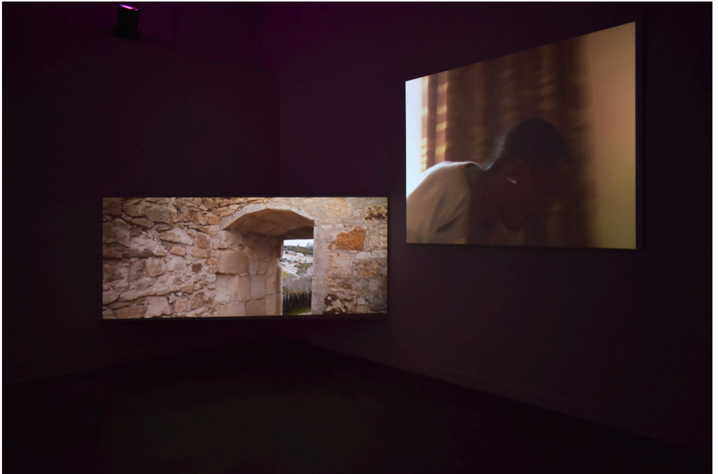
VIR ANDRES HERA, LE DAFTAR, FIVE-SCREEN VERSION. EXHIBITION VIEW, SEIZED BY THE SPIRIT, LES TANNERIES CENTRE D'ART CONTEMPORAIN, AMILLY, 2023.