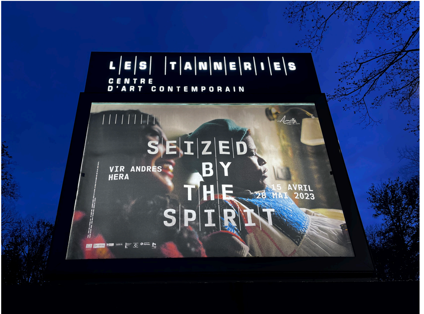
EXHIBITION ANNOUNCEMENT FOR SEIZED BY THE SPIRIT, CENTRE D'ART CONTEMPORAIN – LES TANNERIES, AMILLY, 2023.