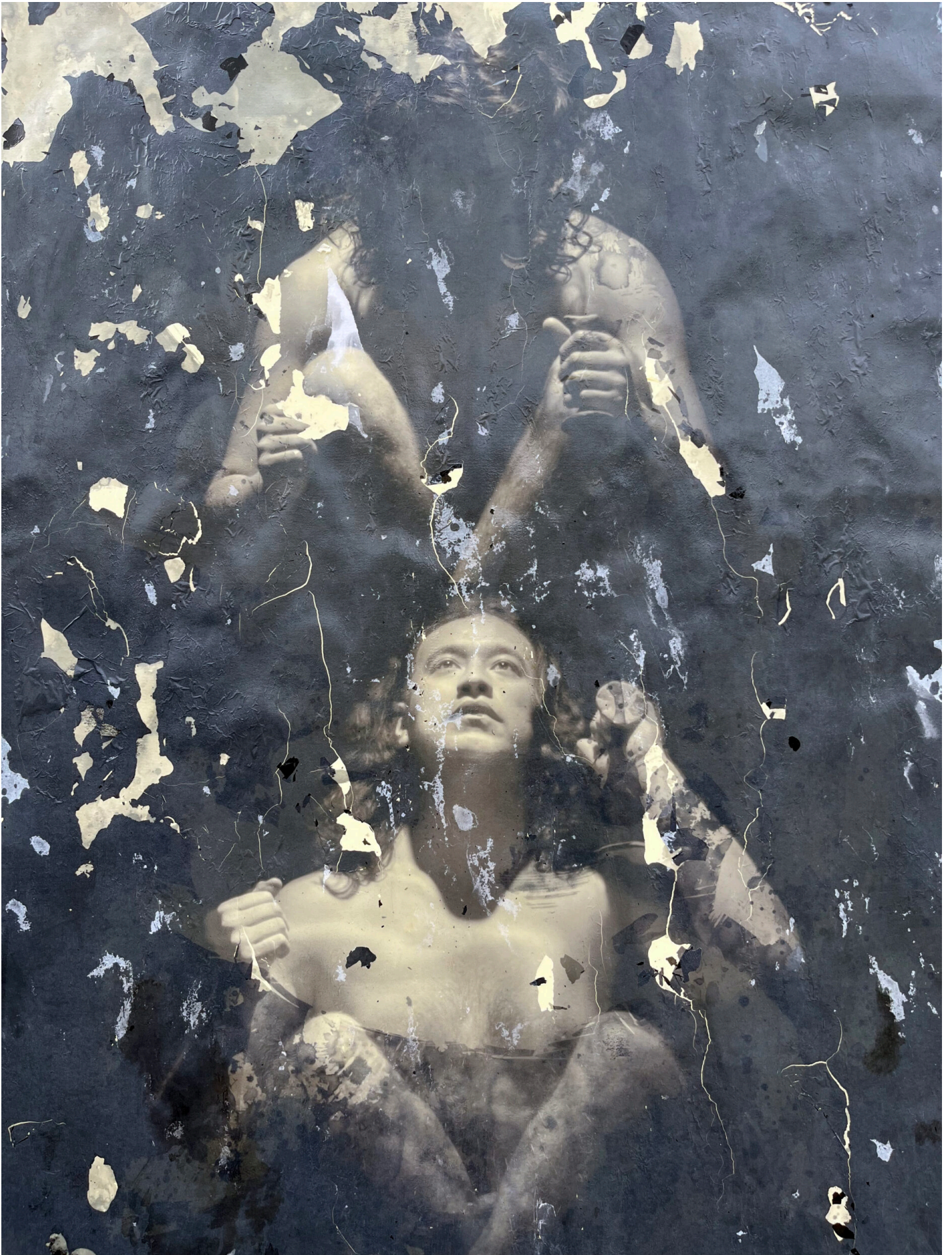
MISURGIA SISITLALLAN THE AFTERLIFE . PHOTOGRAPHIC PRINT TRANSFER ON WATERCOLOR PAPER, LINSEED OIL, INDIA INK. EXHIBITION VIEW, VERRIÈRE.