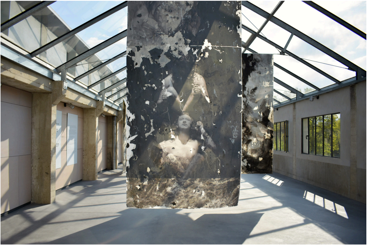
MISURGIA SISITLALLAN THE AFTERLIFE . PHOTOGRAPHIC PRINT TRANSFER ON WATERCOLOR PAPER, LINSEED OIL, INDIA INK. EXHIBITION VIEW, VERRIÈRE.