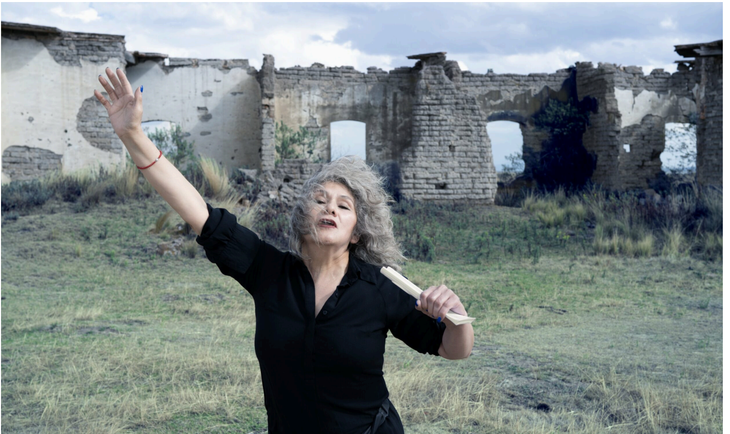
PERFORMANCE REENACTMENT PHOTOGRAPHS BY VIR ANDRES HERA, INCLUDING ARCHIVAL FAMILY PHOTOGRAPHS TAKEN BY THE ARTIST'S GRANDMOTHER AND RE-PHOTOGRAPHED BY VIR ANDRES HERA. COURTESY OF VAH STUDIO.