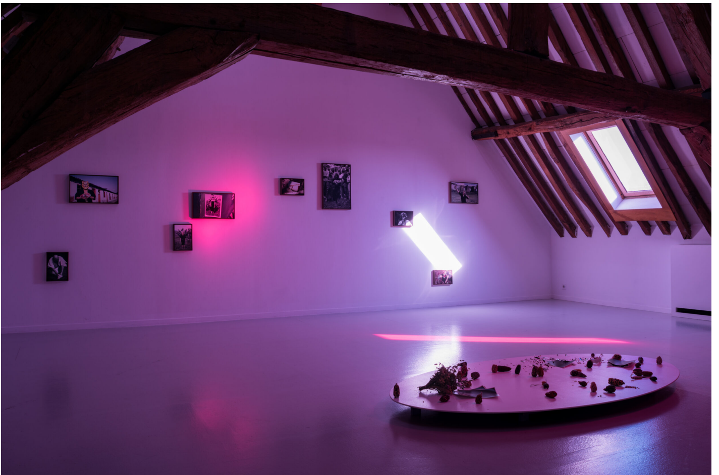
SHAKE CHAMBER, 2025. INSTALLATION VIEW AT TACTICAL SPECTERS, LA FERME DU BUISSON.