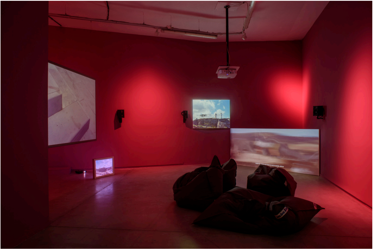
VIR ANDRES HERA, LE DAFTAR, FIVE-SCREEN VERSION. INSTALLATION VIEW, SOLEIL TRISTE, SOL ! LA BIENNALE DU TERRITOIRE 2, MO.CO. MONTPELLIER, 2023.