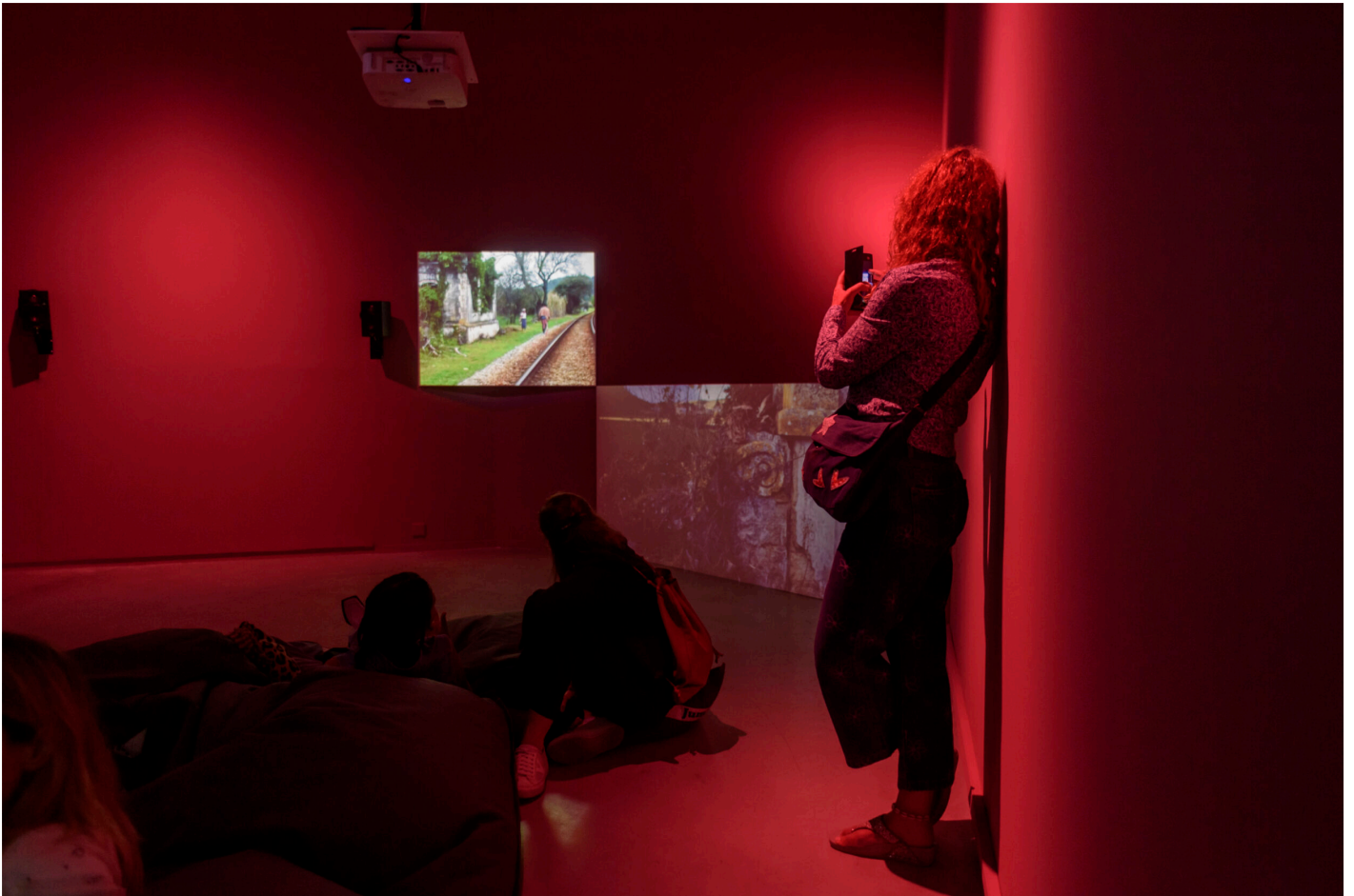
VIR ANDRES HERA, LE DAFTAR, FIVE-SCREEN VERSION. INSTALLATION VIEW, SOLEIL TRISTE, SOL ! LA BIENNALE DU TERRITOIRE 2, MO.CO. MONTPELLIER, 2023.