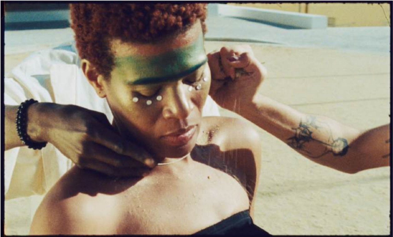
Above: Still from Vir Andres Hera's Step With Me Into The Boundlessness , as screened as part of DISTANCE, PROXIMITY & CONNECTION , London, November 2024.