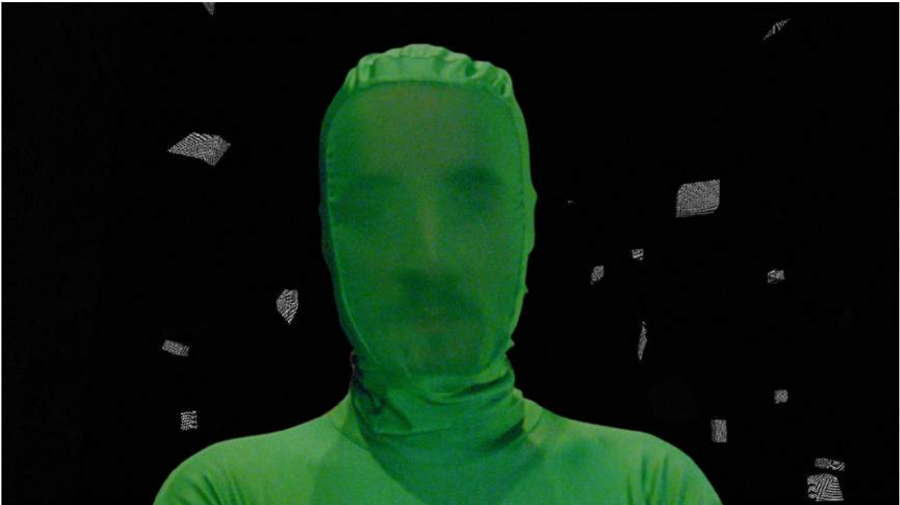
Above: Still from Ben Rivers and Ben Russell's THE RARE EVENT , as screened as part of DISTANCE, PROXIMITY & CONNECTION , London, November 2024.

Meeting Rivers a few weeks later at his studio-home in East London, he shares how him and Ben Russell 'set themselves rules to follow that opened up their footage to chance, to surrendering total control of what scenes were captured.' Each day they shot on film for five minutes every hour, no matter where the dialogue was at, the camera on a dolly device, moving around the discussion groups. They would also adjust the height of the camera throughout the day, so that gradually the focus shifted from eye-level to body-level, attention itself as a meandering being, and continually explored modes of perception, of letting these decisions manifest through unexpected moments or phrases - the viewer pulled scene to scene with the roving camera, the dialogue never scripted or foreseen. Thus, the conversation moved with somewhat of a removal, from the entirety of the event, its fragmented form losing coherent meaning, instead offering a dialogue warped and on the edge of understanding. It was also freeing and animated in this sense - screened was a layered polyphony of communication and interruption, moving with time and space as opposed to rigid scripting, ways of looking, thinking and re-presenting within moving image opened up.