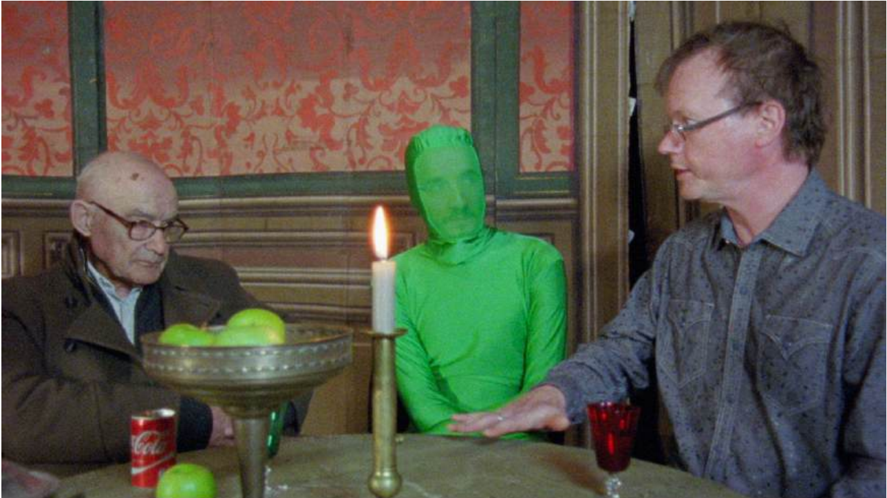
Above: Still from Ben Rivers and Ben Russell's THE RARE EVENT , as screened as part of DISTANCE, PROXIMITY & CONNECTION , London, November 2024.

place' beyond the dense philosophic discussions. They seem to be questioning, picking up and attempting to compute narratives engaged with, a figure on the edge. The conversations in the film centred magic and opacity - much like that of the man, of the trance-like state he moves in and out of realities, and the roving eye of the camera capturing moments from states of dreaming to intense debate.