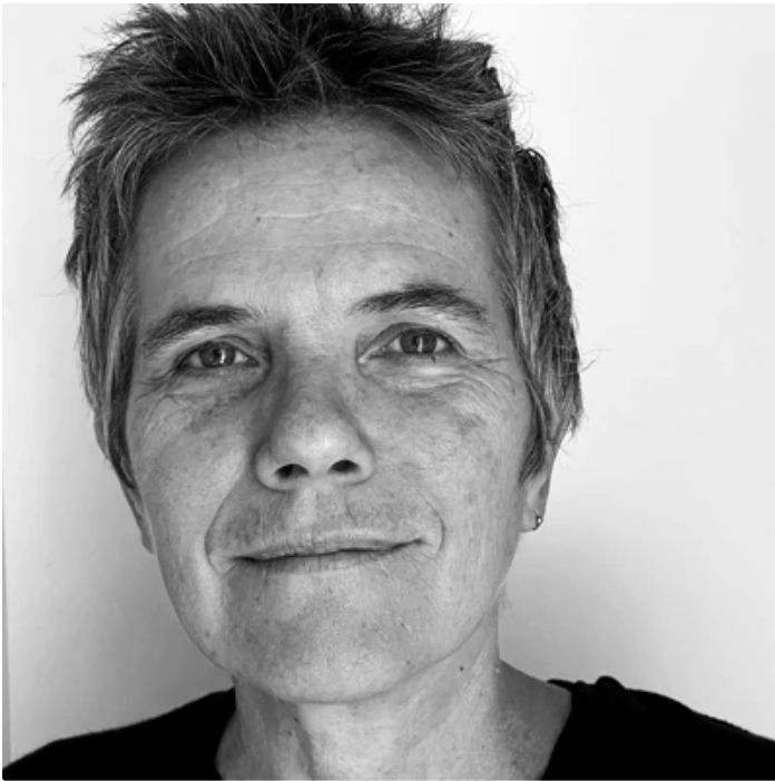
Bénédicte Alliot Director General of the Cité internationale des arts